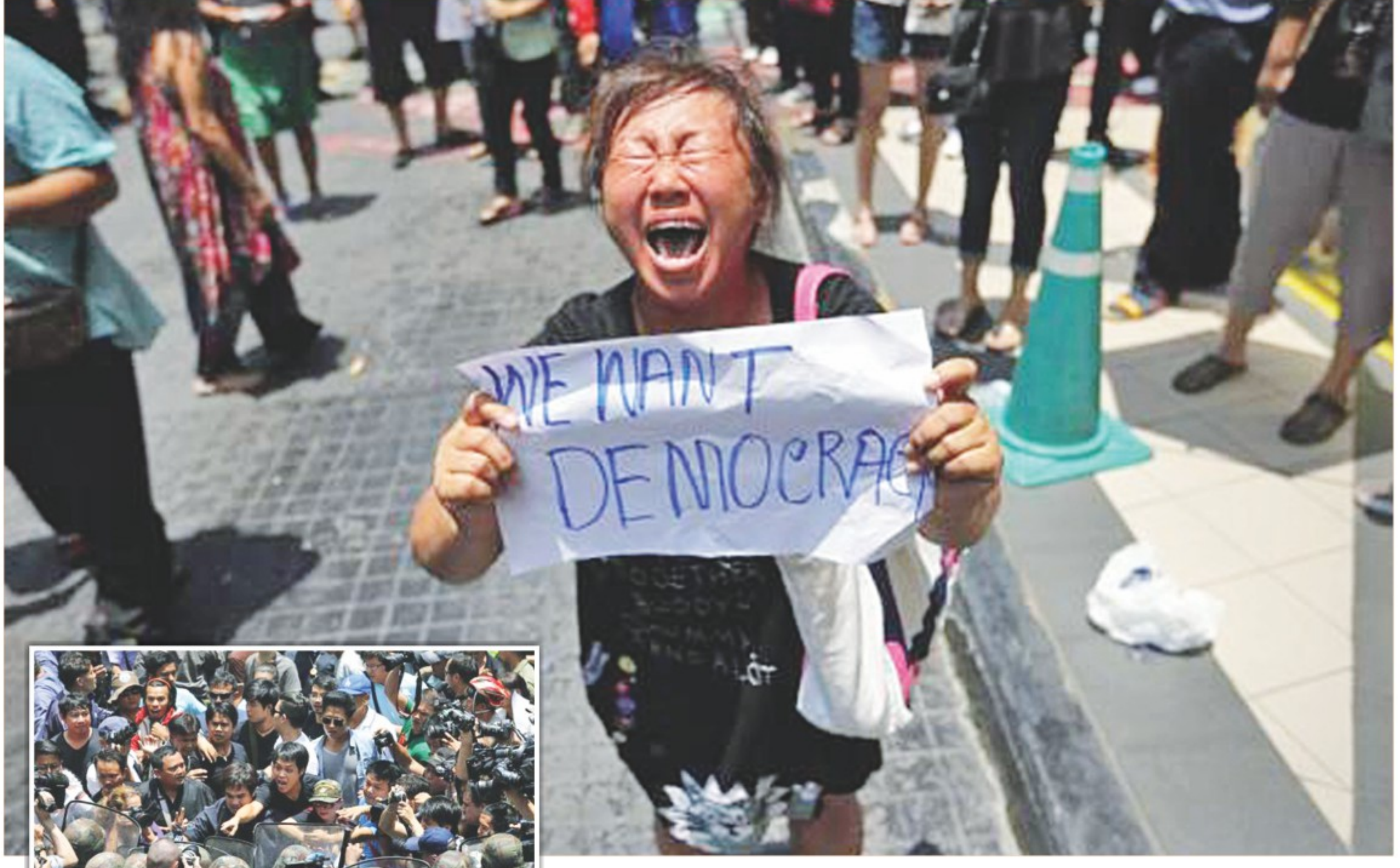
A woman screams as she joins other protesters against military rule as they confront soldiers and police at Bangkok's shopping district, yesterday. Inset, angry anti-coup protesters confront military in the capital.