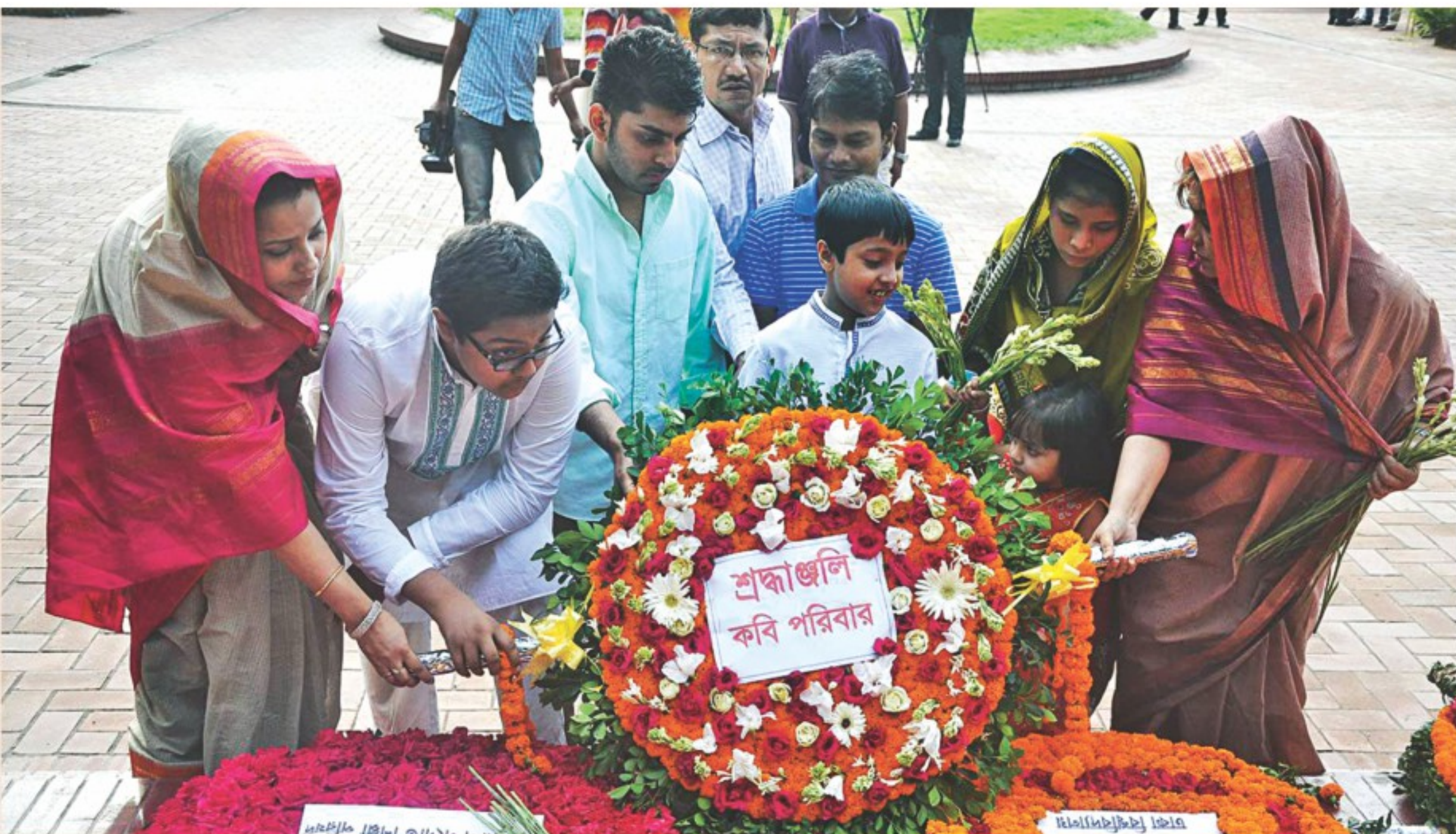
Family members of Poet Kazi Nazrul Islam lay a wreath at his grave on Dhaka University campus in the capital yesterday marking his birthday.