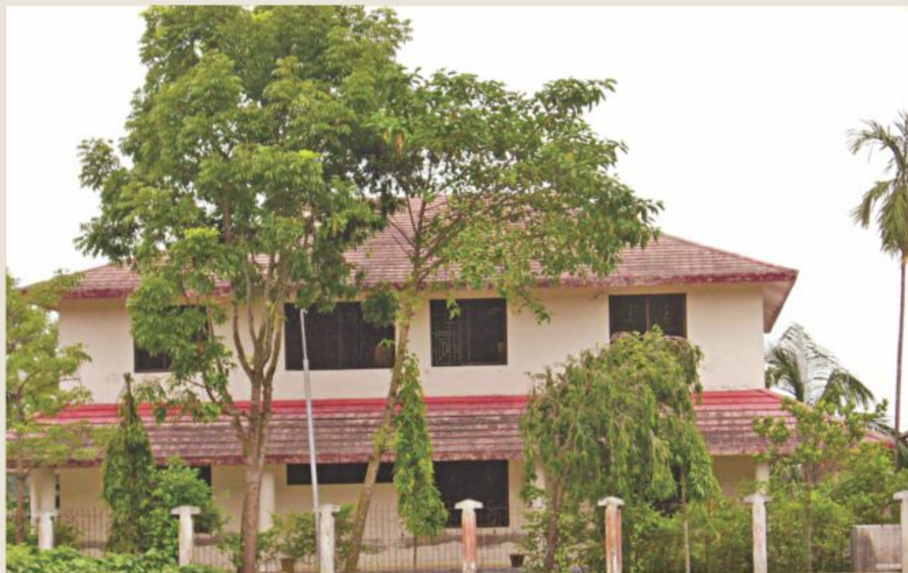
The Nazrul Smriti Kendra in Kazir Shimla.