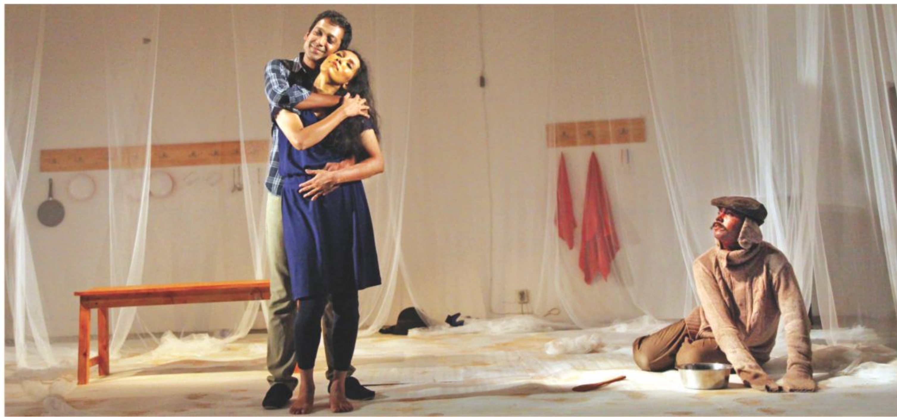
The cast is the biggest strength of the play.