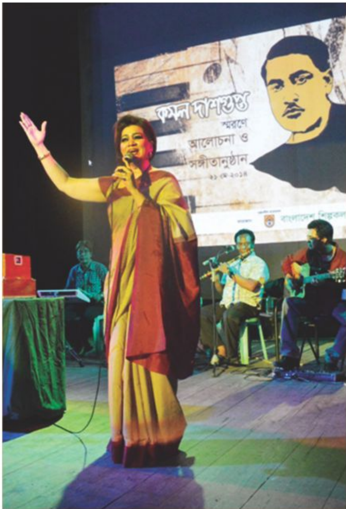
Shakila Zafar performs at the event.