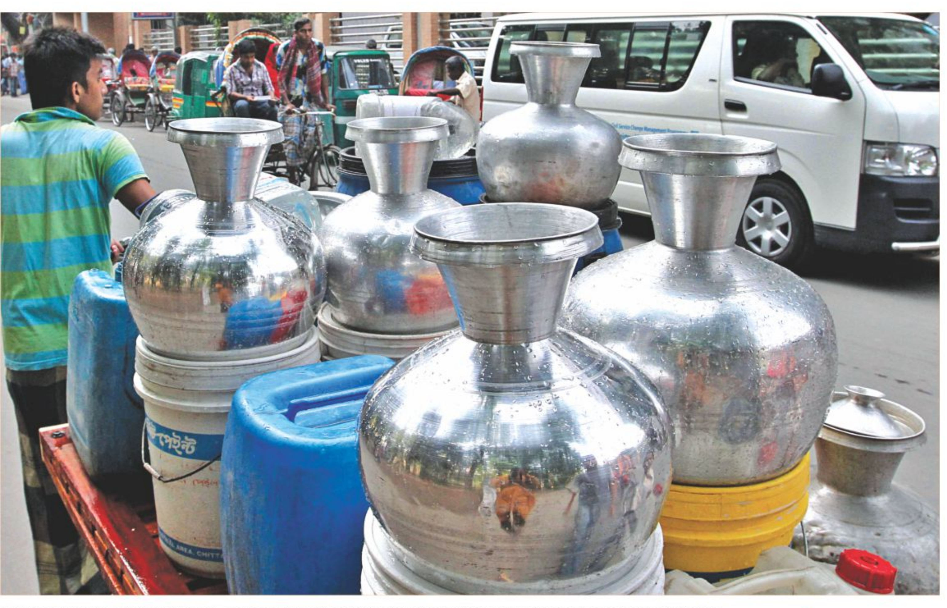
A rickshaw van carrying pitchers and cans full of water to Eskaton in the capital from a Wasa pump station in Ramna. Several areas of Dhaka are suffering from water supply problems.