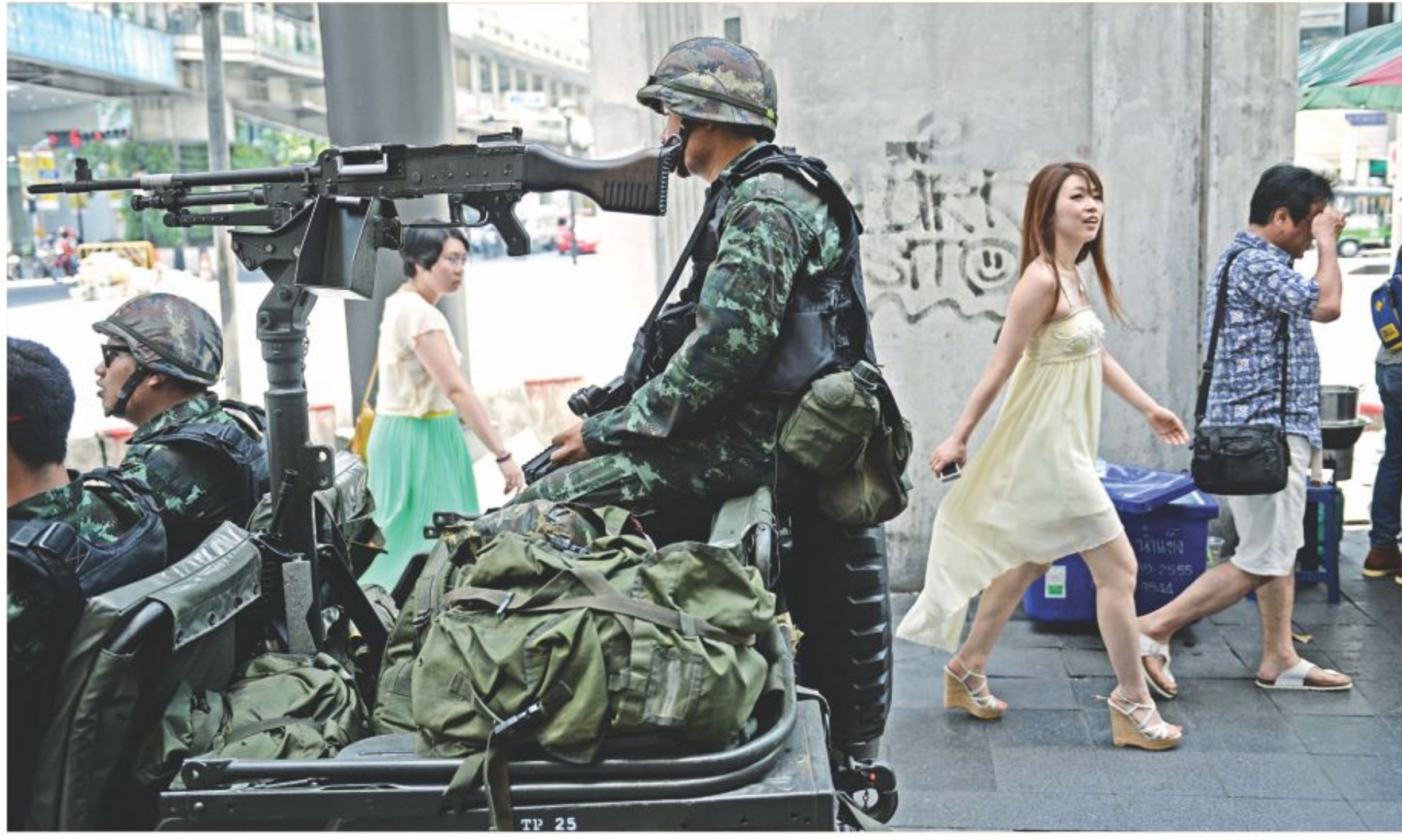
People walk past Thai army soldiers sitting in a jeep mounted with a machine gun as they secure a main intersection in Bangkok, yesterday. Thailand's army declared martial law across the deeply divided kingdom yesterday to restore order after months of deadly anti-government protests, deploying armed troops in the capital but insisting the move was "not a coup".

Beijing's furious response came one day after the US charged five members of a shadowy Chinese military unit with allegedly hacking US companies for trade secrets. In the first-ever prosecution of state actors over cyber-espionage, a federal grand jury indicted the five on charges they broke into US computers to benefit Chinese state-owned companies, leading to job losses in the US in the steel, solar and other industries. Cyber-spying has long been a major sticking point in relations but Washington's move marked a major escalation in the dispute. Analysts said the US was unlikely to be able to put the men on trial but the indictments were an attempt to apply public pressure on China over the issue. The grand jury indicted each of the five on 31 counts, which each carry up to 15 years in prison. US Attorney General Eric Holder called on China to hand over the men for trial in Pittsburgh and said the United States would use "all the means that are available to us" should it refuse.