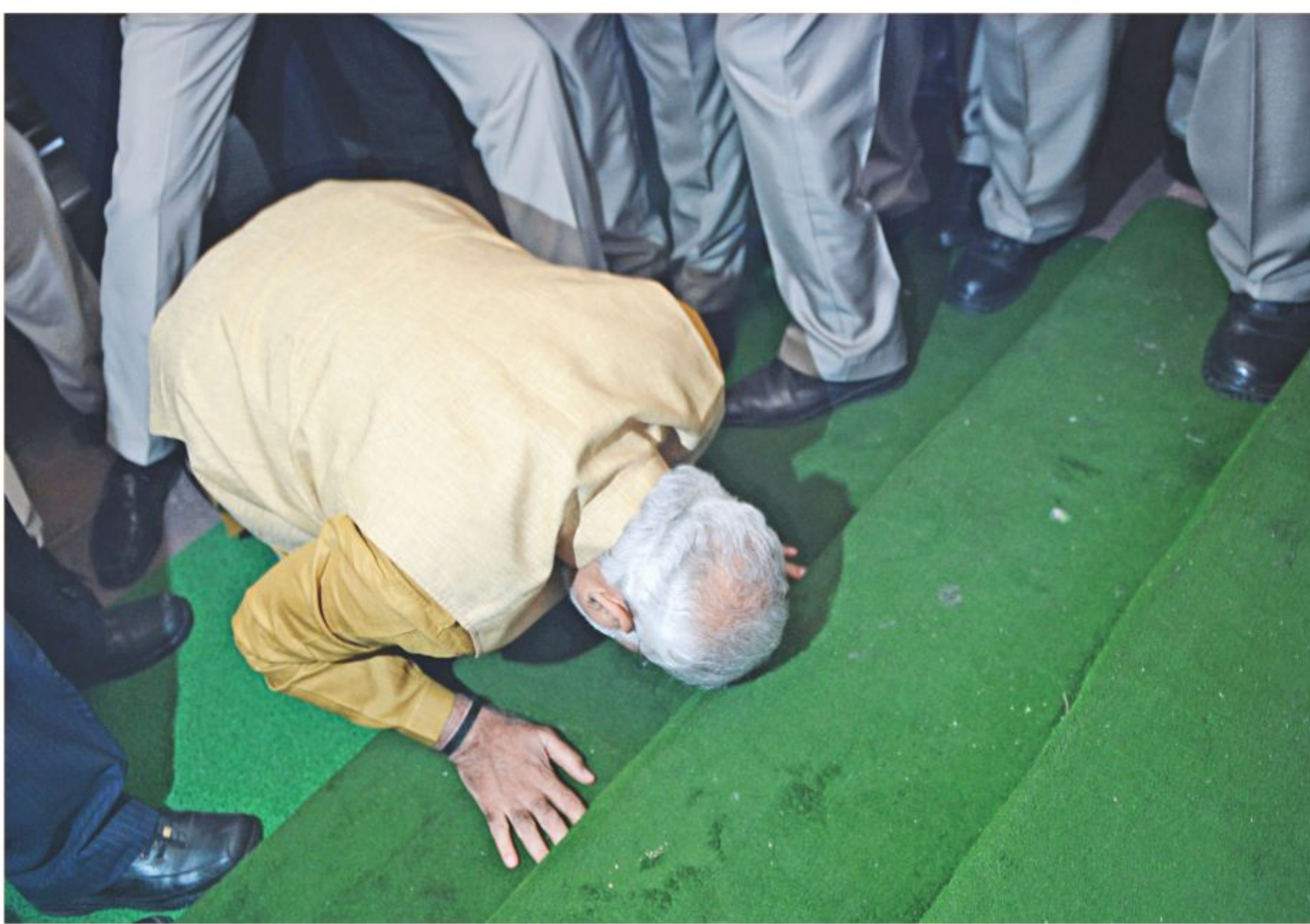
Indian Bharatiya Janata Party (BJP) leader and the National Democratic Alliance (NDA) prime ministerial candidate Narendra Modi prostrates after arriving on the first step of the Parliament building in New Delhi, yesterday. India's prime minister-elect Narendra Modi choked back tears and promised to try to live up to expectations as he made his first visit to parliament since his sweeping election victory.

AFP, New York Jurors in the New York trial of British hate preacher Abu Hamza on Monday found him guilty of kidnapping and terrorism offenses. The former imam of the north London Finsbury Park mosque showed no reaction to the verdict, which carries a possible life sentence. He is to be sentenced September 9. The charges against him pre-dated the 9/11 attacks on New York and were over the 1998 abduction of 16 Western tourists in Yemen, four of whom were killed in a