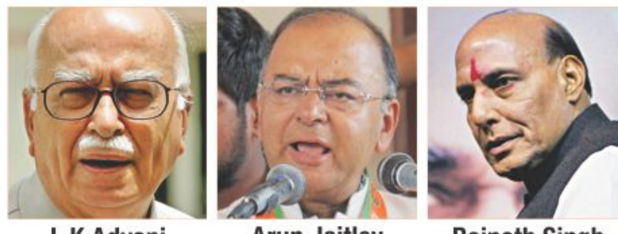
L K Advani Arun Jaitley Rajnath Singh

The BJP leadership made some progress in settling top slots in the next Indian government with party chief Rajnath Singh tipped to be the home minister while senior leader Arun Jaitley could be the next finance minister. While a degree of clarity is emerging on ministry formation, the BJP is yet to resolve its dilemma over veteran leader L K Advani as the leader's apparent inclination to be Lok Sabha Speaker is not finding many takers. The hunt for a suitably distinguished post for Advani has not met with much success and the party leadership is unclear how to define the saffron elder's role and work out an arrangement where he can be a mentor. With Rajnath and Jaitley expected to occupy two key slots in the cabinet committee on security (CCS), PM-designate Narendra Modi is still left with the tough task of filling the two other CCS slots, external affairs and defence. Sushma Swaraj, who was Leader of Opposition in the 15th Lok Sabha, is keen on a CCS berth, but there are doubts if Modi will be keen to accommodate her. Though Swaraj is certain to be offered an important portfolio — HRD and health were referred to — her lack of enthusiasm for Modi's PM candidature may have weakened her claim to a seat at the ministerial highest table. Among allies, LJP leader Ramvilas Paswan is certain to get an important portfolio, keeping in mind the assess-