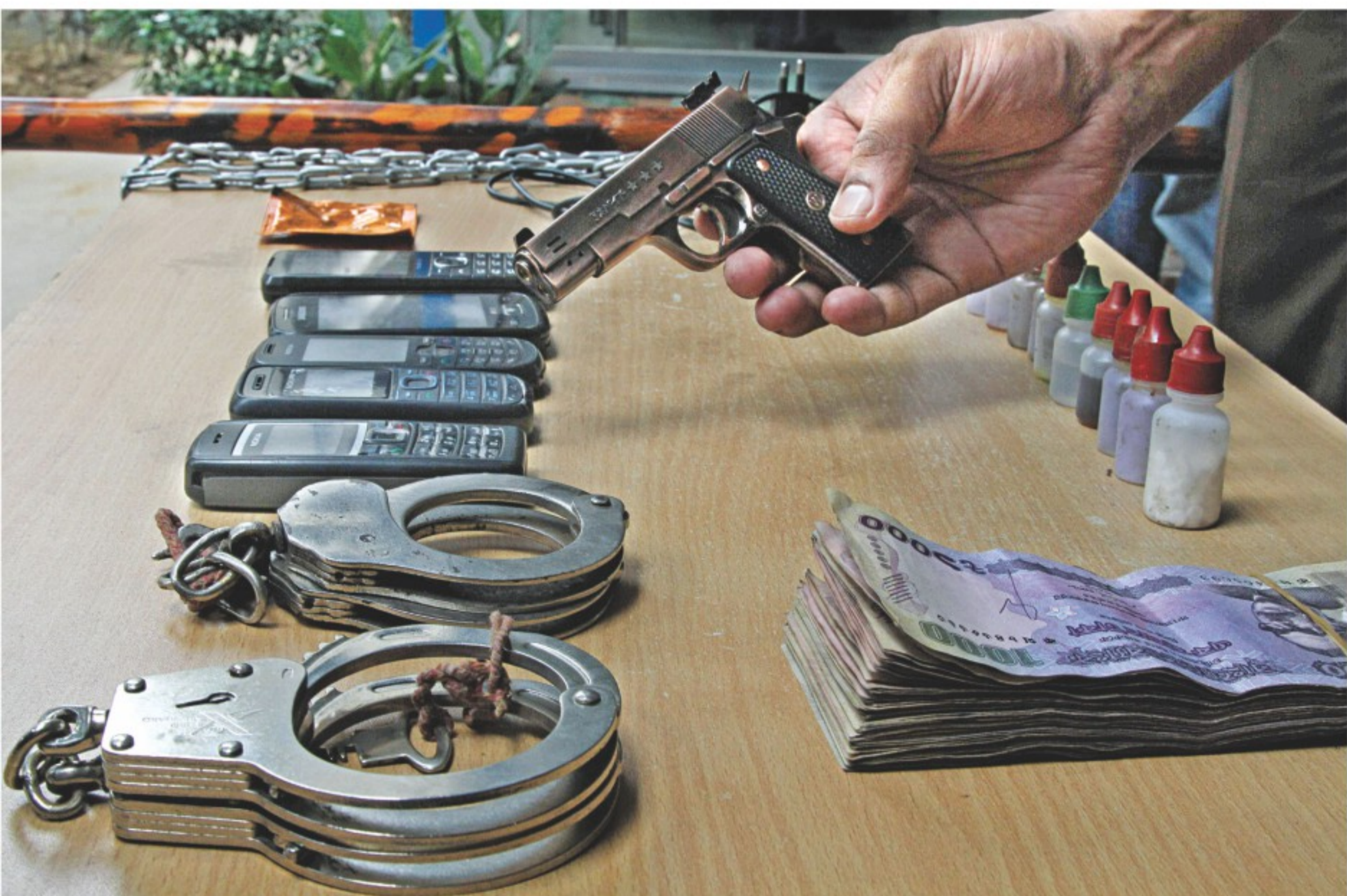
Detective Branch of police shows the handcuffs, drugs, money, phones, and the fake pistol they seized from a gang of five alleged kidnappers on Sunday. The photo was taken from DMP media centre in the capital yesterday.