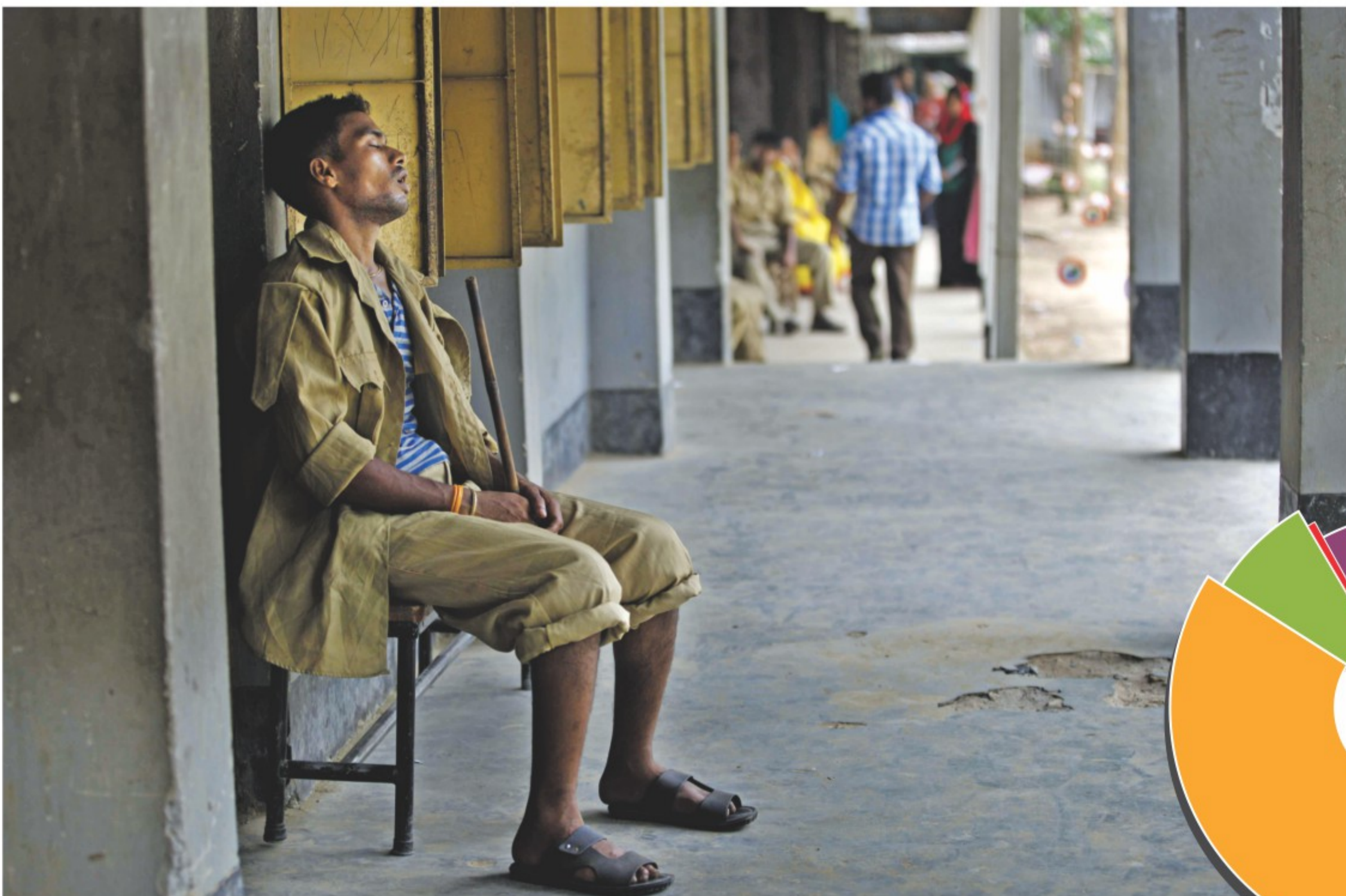
A security staff falls asleep on a bench in Pirujali Amania Fazil Madrasa polling centre around noon yesterday. Voter turnout was very poor in the polls to the Gazipur Sadar Upazila Parishad.

STAR REPORT The ruling Awami League-backed chairman aspirants won in seven upazilas, while the BNP favourites came out victorious in five in yesterday's upazila polls. However, the chairman post in the other upazila went to an AL rebel, according to unofficial results declared by the returning officers. Stray incidents of violence, vote rigging, stuffing of ballots and capturing of polling centres by the AL men were reported in at least five upazilas out of 13 that went to the polls. At least 25 people were injured in the violence and 11 were arrested over creating violence and casting fake votes in different upazilas. The Election Commission has postponed voting in two polling centres and cancelled it in one due to violence and vote rigging, said Chief Election Commissioner Kazi Rakibuddin Ahmad. "According to reports by our officials, polling in the remaining areas was fair and peaceful," the CEC told a press conference at the EC's media centre last evening. After lagging behind in the first phase of the upazila polls, AL men resorted to violence and vote rigging in the next phases. Yet chairman candidates backed by the AL were trailing in the polls till the end of the third phase. With the fourth phase over, the party's favourites took the lead from rival BNP-backed candidates. Although the scale of violence and irregularities was SEE PAGE 10 COL 1