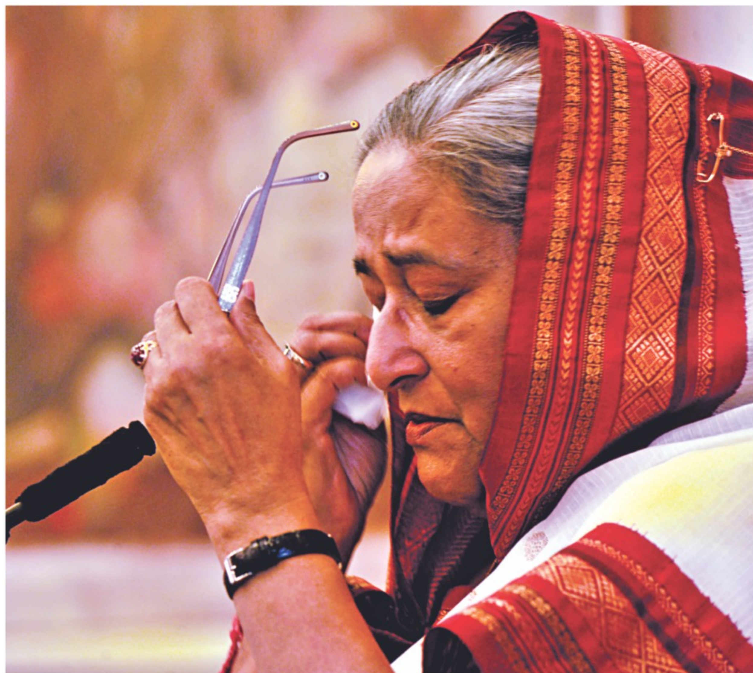
Prime Minister Sheikh Hasina wipes off tears while talking about her life after the August 15, 1975 murder of family members, including Bangabandhu Sheikh Mujibur Rahman. The photo was taken at the Gono Bhaban yesterday at a programme organised to mark her homecoming day.

"I've dedicated myself to the nation's welfare and materialising the