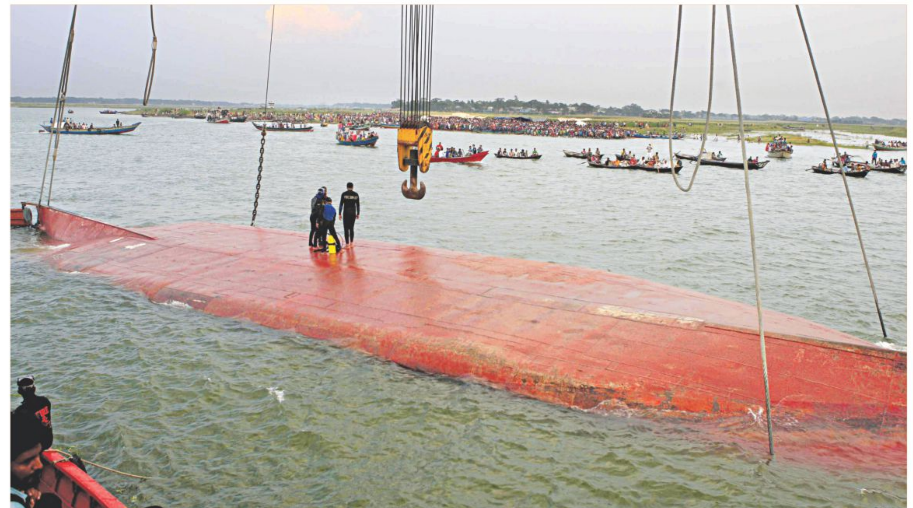
A rescue vessel trying to pull the capsized launch MV Miraj-4 towards the shore of the Meghna in Munshiganj yesterday.