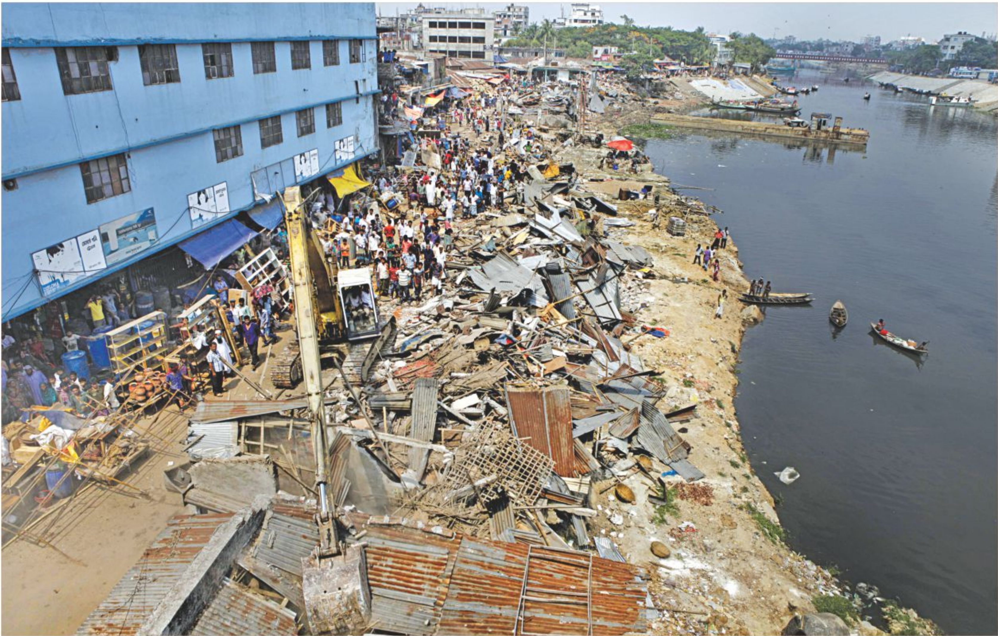
A digger demolishes illegal structures on the river Turag near Tongi kitchen market yesterday leaving a pile of debris along the shore. Bangladesh Inland Water Transport Authority, the district administration of Gazipur and police on the second day of their drive only cleared the land for building a pavement, leaving most of the illegal structure untouched.