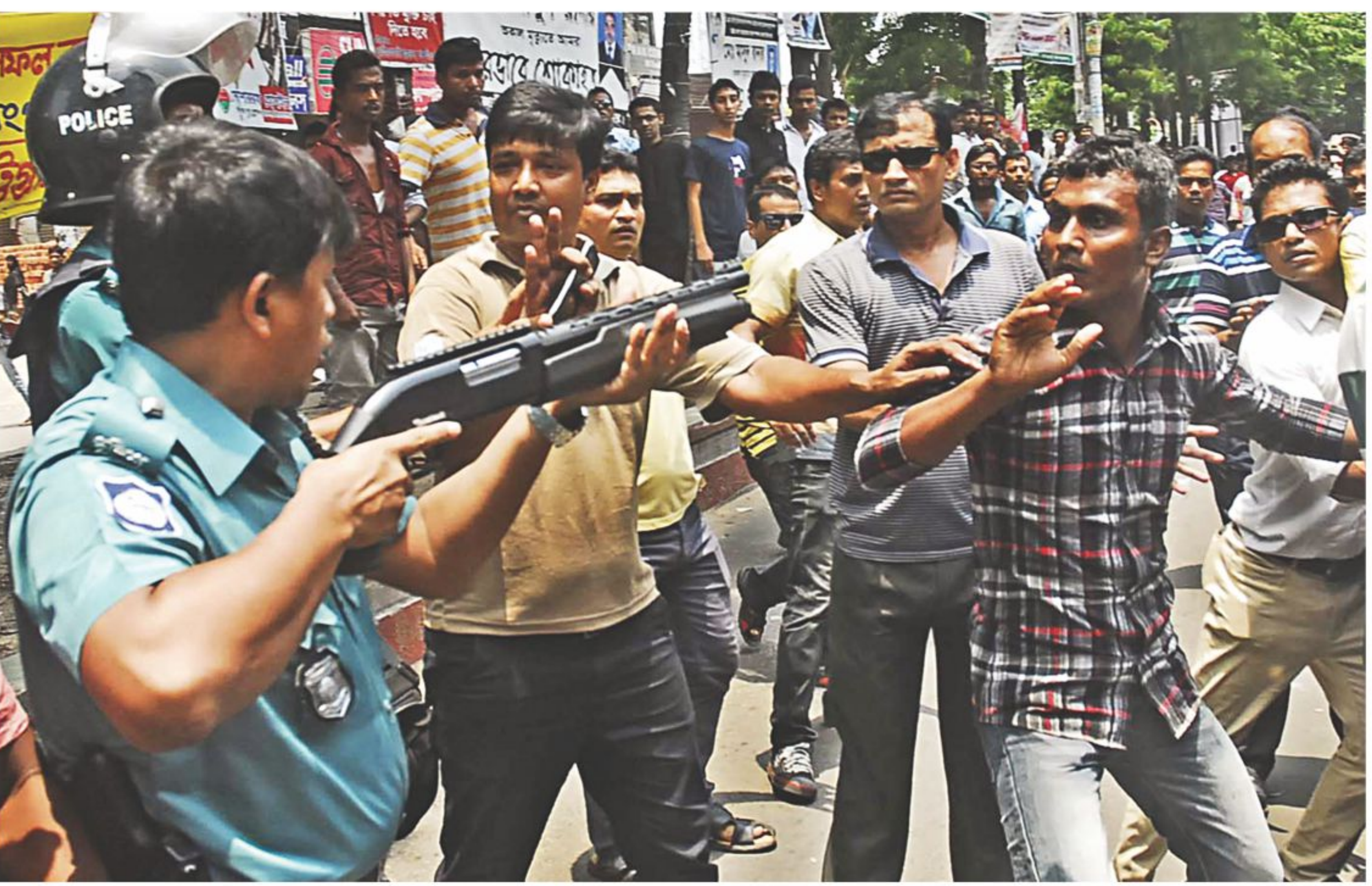
A policeman aims his shotgun at a group of Jatiyatabadi Chhatra Dal (JCD) activists in Kazir Dewri area of Chittagong city yesterday. The JCD men tried to hold a rally there in front of the city BNP office, demanding withdrawal of cases filed against BNP Chairperson Khaleda Zia and her son Tarique Rahman. Police said the student organisation did not take permission for the rally.