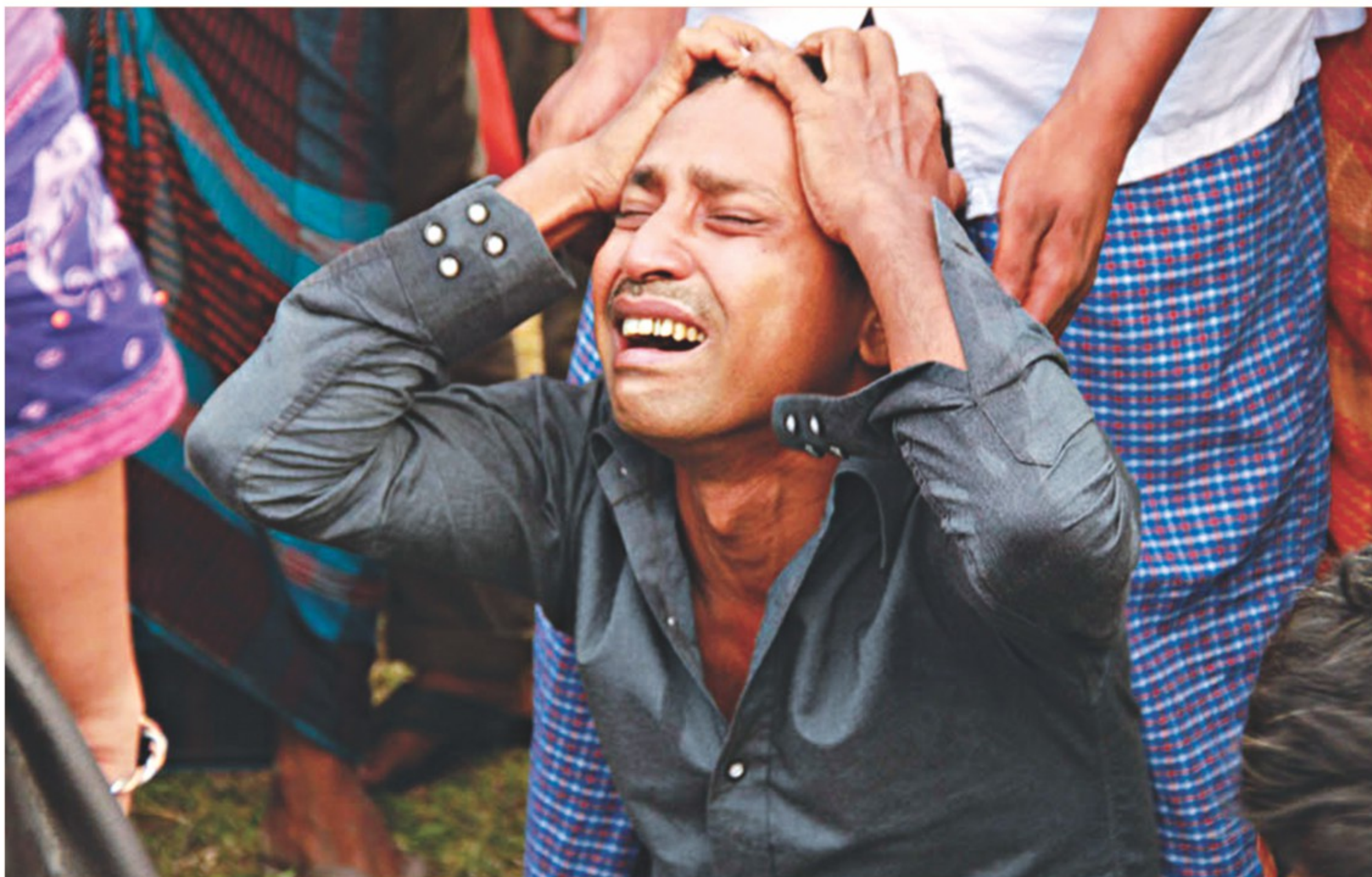
A man, who made it ashore swimming through the waves of the Meghna during a nor'wester, wails as his brother who was travelling with him in the ill-fated launch was missing and feared dead. The photo was taken at Doulatpur in Munshiganj where the launch capsized.