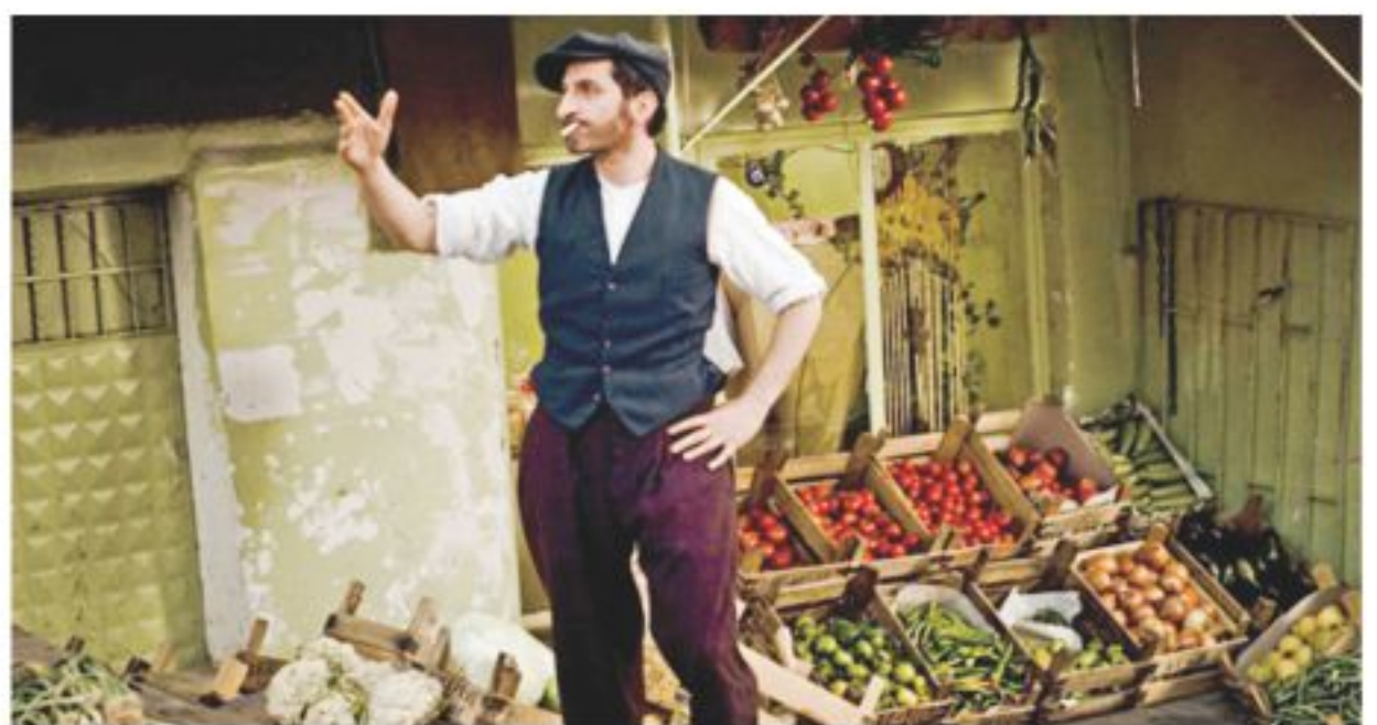
A scene from "Almanya".