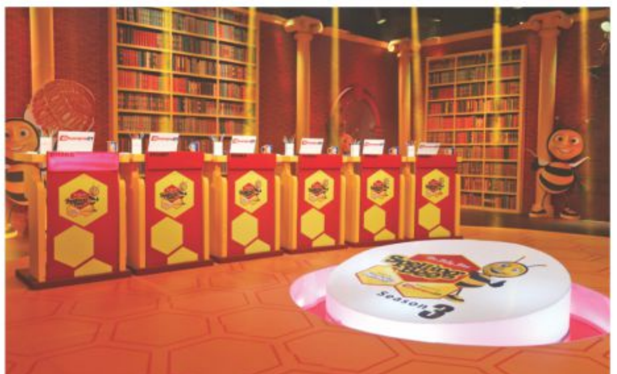
The stage is all set for the spellers.

The Daily Star is a partner of the programme.