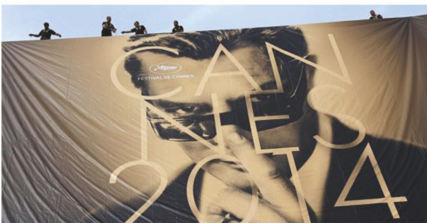
Workers set up a giant official poster of the 67th Cannes film festival.