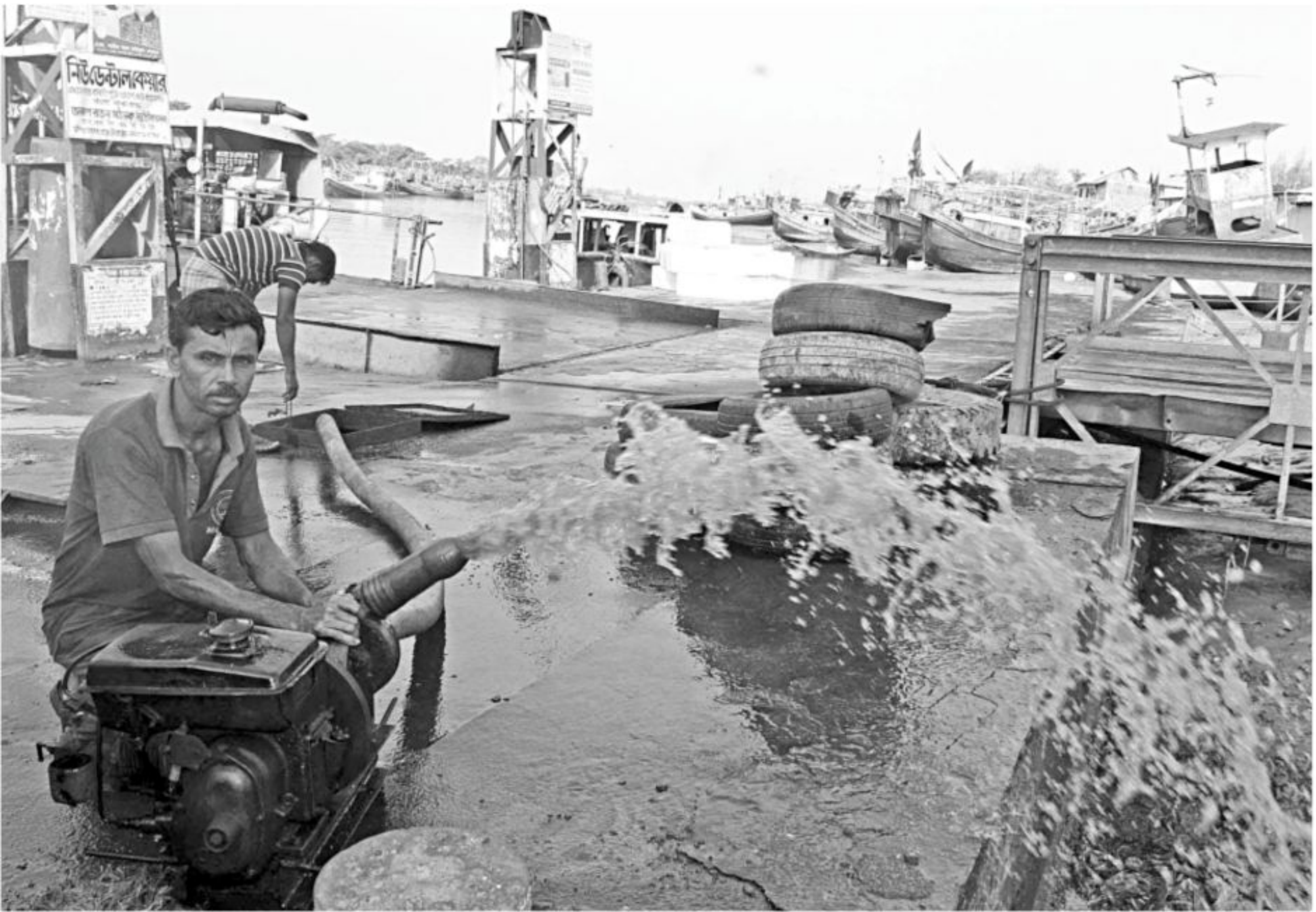
A worker pumps out water from inside the damaged pontoon at Mohipur ferry terminal on Patuakhali-Kuakata road to keep it floating and operational.