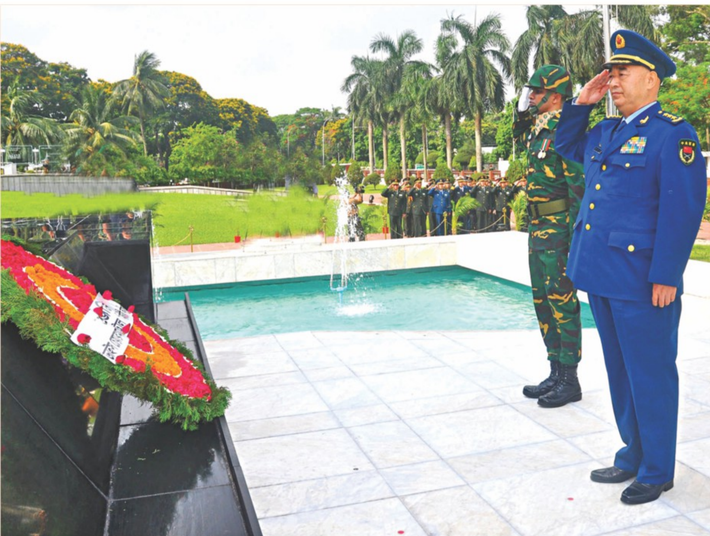
Visiting Chinese Air Chief Marshal General Xu Qiliang, a member of the politburo of the Communist Party of China, also vice chairman of the Central Military Commission, pays respect to the Liberation War martyrs of the Bangladesh armed forces yesterday at Shikha Anirban in Dhaka Cantonment.