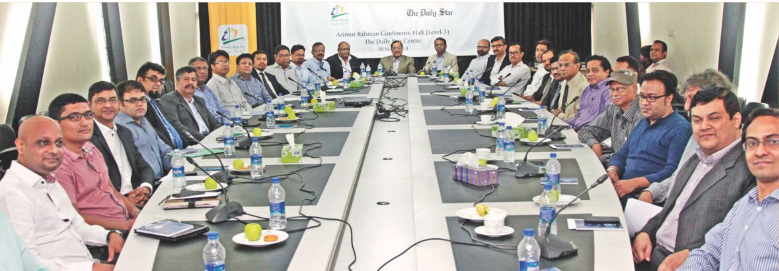
Analysts attend a roundtable on the electronic payment system, organised by Eastern Bank and The Daily Star yesterday.

Roundtable organised by EBL and The Daily Star focuses on e-payment