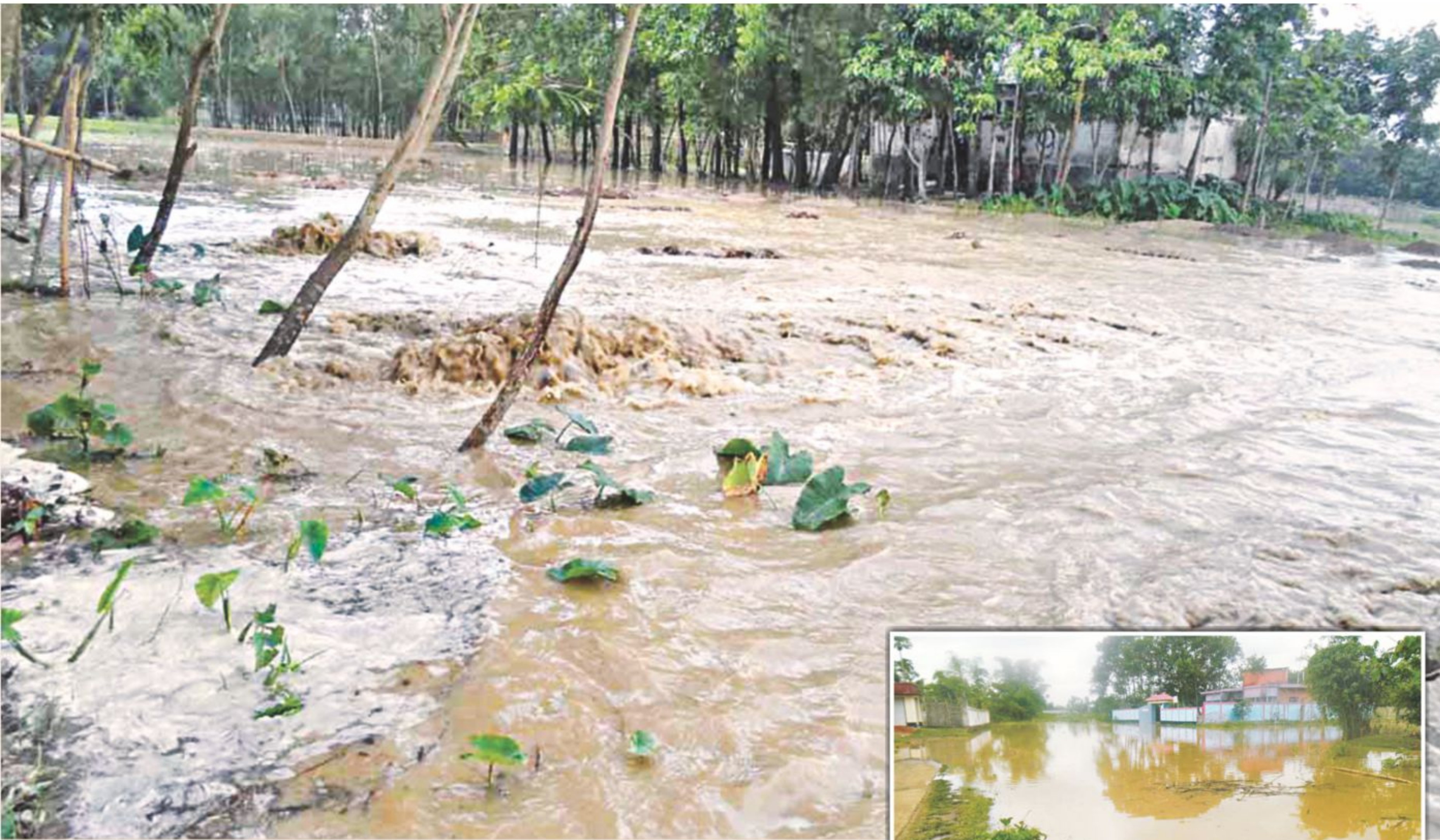
Rushing floodwater at Dholai in Kamalganj upazila of Moulvibazar yesterday. Some 50 villages were inundated by flooding in Kamalganj and Kulaura upazilas, as heavy downpour in the last two days caused the Dholai and Monu rivers to overflow. Inset, a flooded neighbourhood near Bhanugachh bazar in Kamalganj.