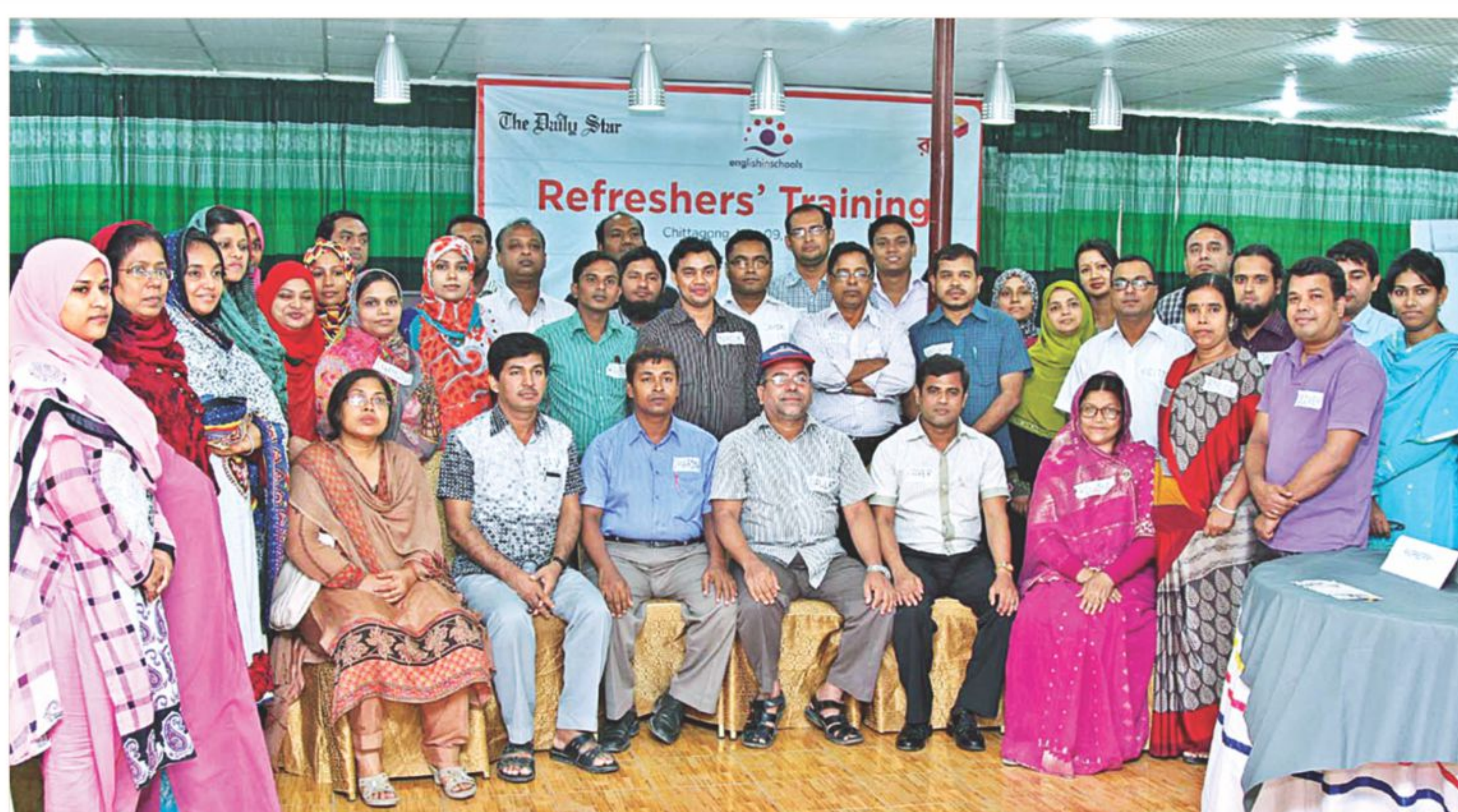
Participating teachers at Refreshers' Training, a part of The Daily Star-Robi programme "English in Schools", at European College of Law and Business in Chittagong city yesterday.