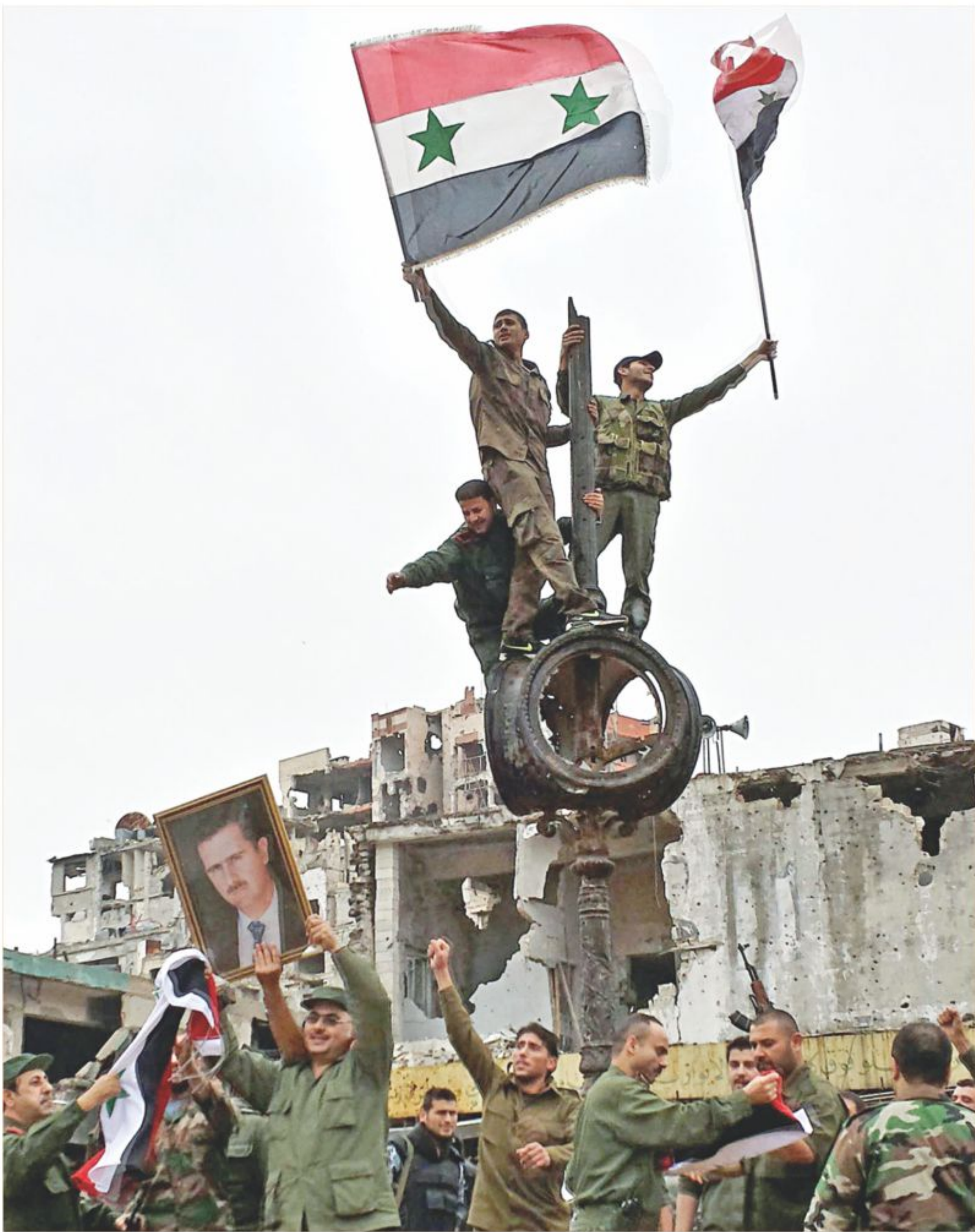
Syrian government forces hold up a portrait of President Bashar al-Assad while others raise the national flag on top of a pole in the old city of Homs yesterday, following a negotiated withdrawal of rebel fighters from the city centre where the opposition had held out under tight siege for nearly two years is the first in more than three years of conflict. The last rebels yesterday left the centre of the battleground Syrian city of Homs yesterday, handing a symbolic victory to President Bashar al-Assad ahead of a controversial election.

Red Shirt chairman Jatuporn Prompan earlier accused the court and NACC of "teamwork" with the anti-government protesters in an attempt to pincer the ruling party. Warning of an imminent military coup, he urged Red Shirts to join a major rally tomorrow.