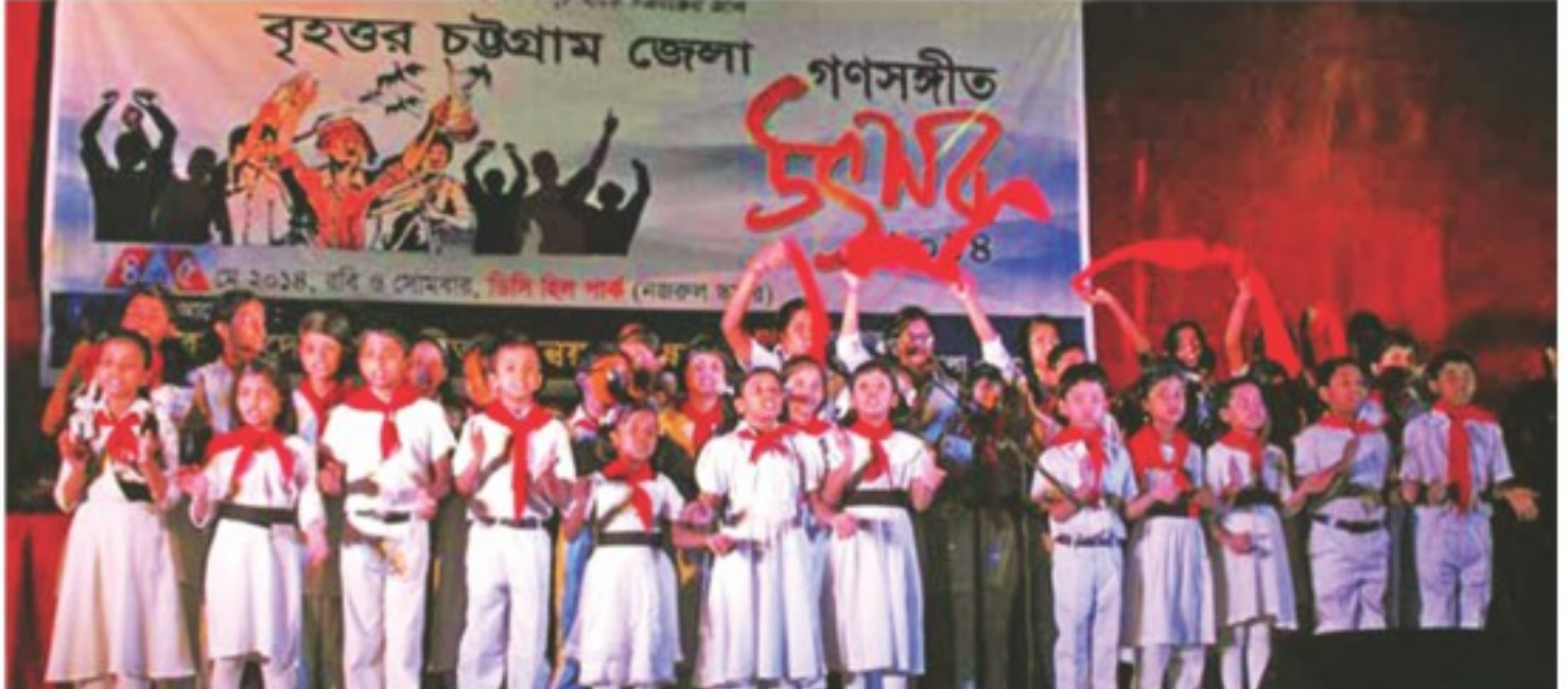
Khelaghor artistes perform at the event.

To revive people's songs that inspire in citizens a sense of belonging, a two-day festival of Gono Sangeet was held in Chittagong city on May 4 and 5. Bangladesh Gono Sangeet Samannay Parishad organised the festival in association with Bangladesh Shilpakala Academy. This was an effort to revive Gono Sangeet -- that had steadily lost popularity over the years. The festival started with the national anthem at DC hill park (Nazrul Square), followed by a