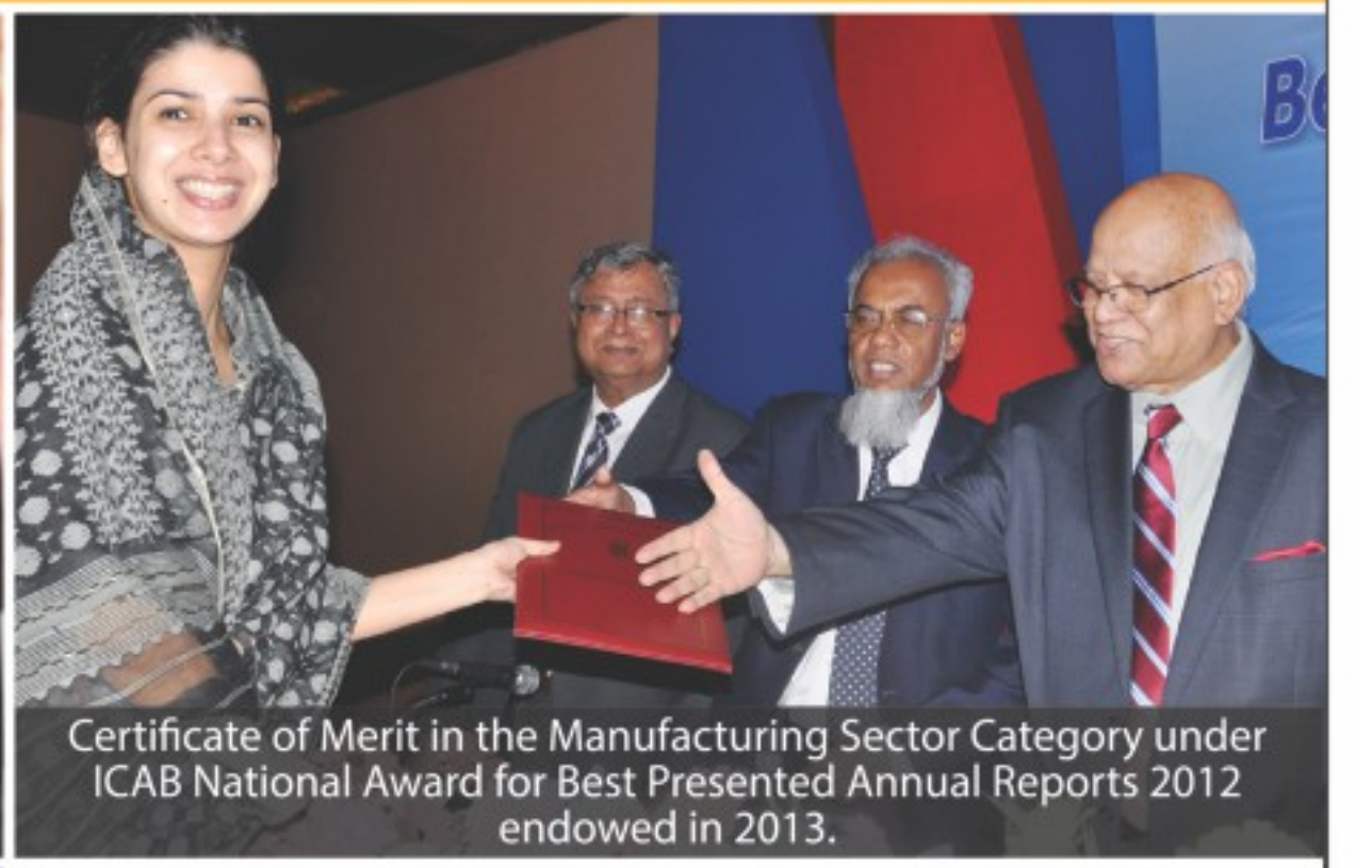
Certificate of Merit in the Manufacturing Sector Category under ICAB National Award for Best Presented Annual Reports 2012 ended in 2013.