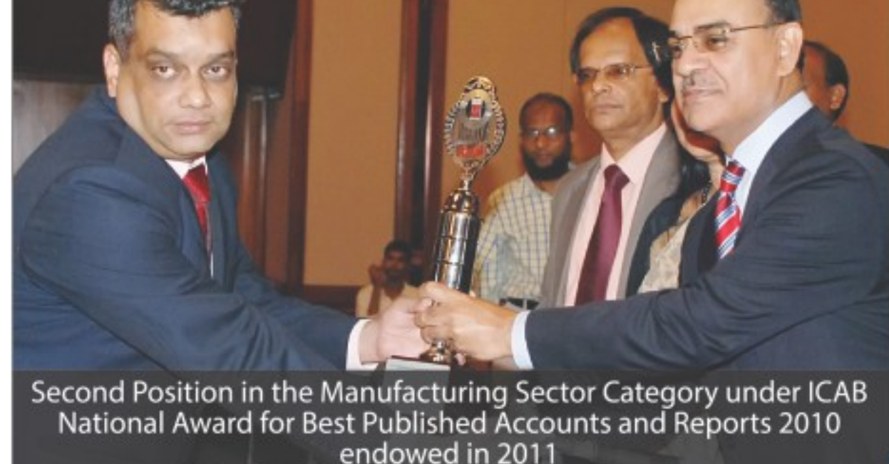
Second Position in the Manufacturing Sector Category under ICAB National Award for Best Presented Accounts and Reports 2010 ended in 2011