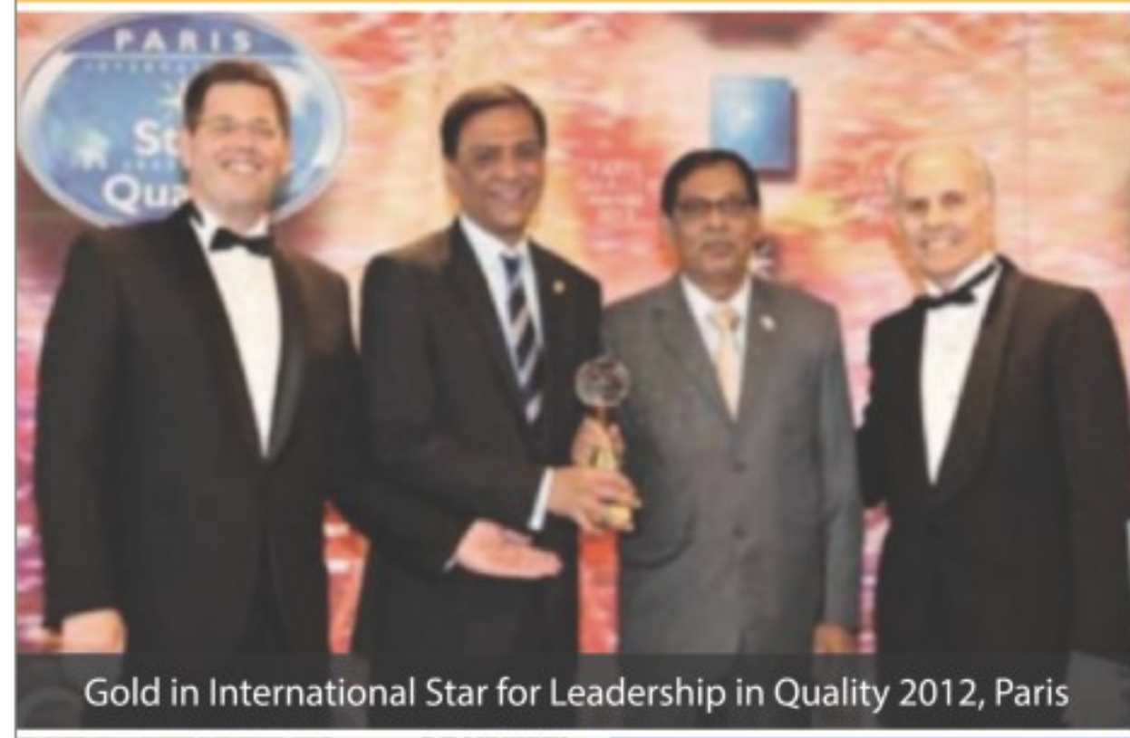
Gold in International Star for Leadership in Quality 2012, Paris