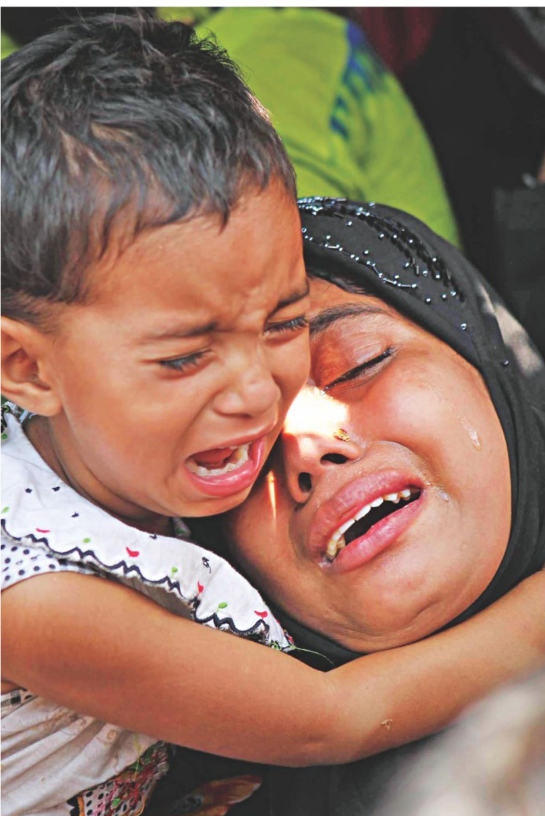
Losing her sister, a woman and her daughter cries on the Golachipa river of Patuakhali yesterday. A launch, ML Shathil, sank there during a nor'wester Saturday afternoon with over 60 passengers, leaving at least 15 dead and many more missing.