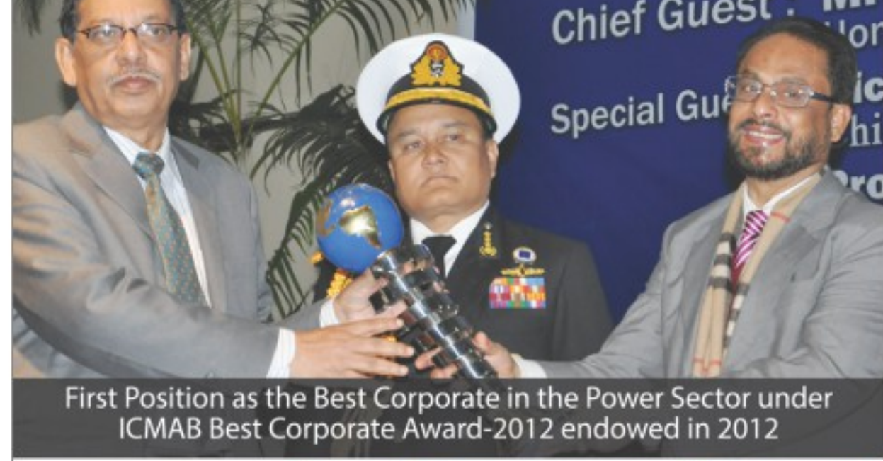
First Position as the Best Corporate in the Power Sector under ICMAB Best Corporate Award-2012 ended in 2012