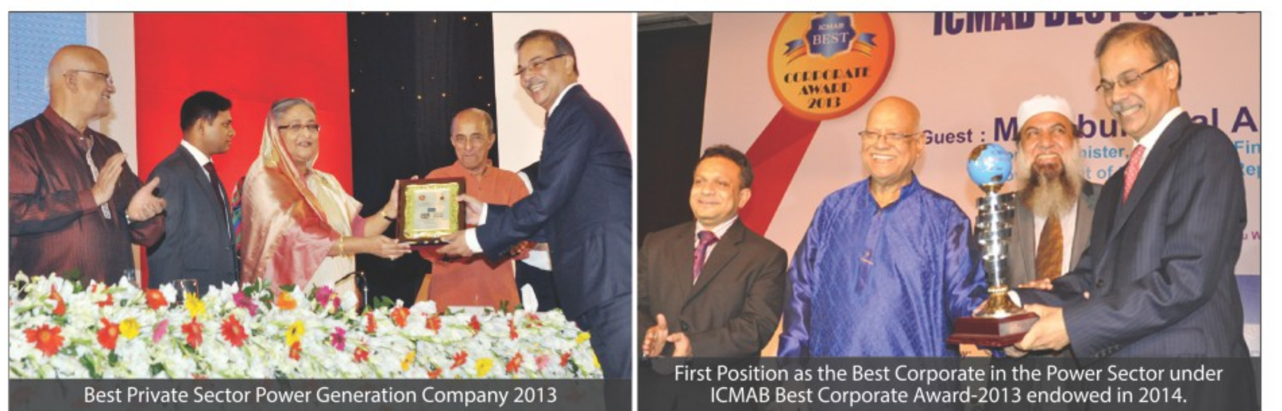
Best Private Sector Power Generation Company 2013