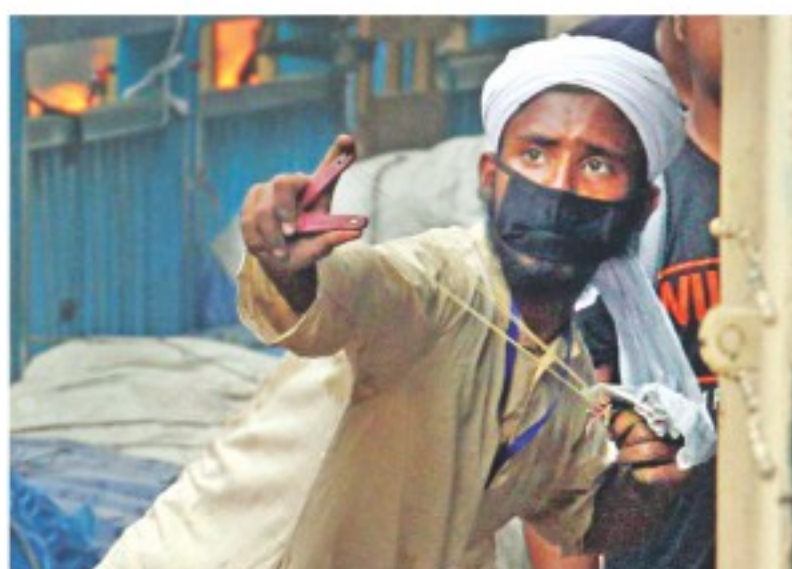
with Shahbagh Police Station. Seven of them were lodged as murder cases.

Of the 42 cases, 33 were filed with Paltan Police Station, six with Motijheel Police Station and three