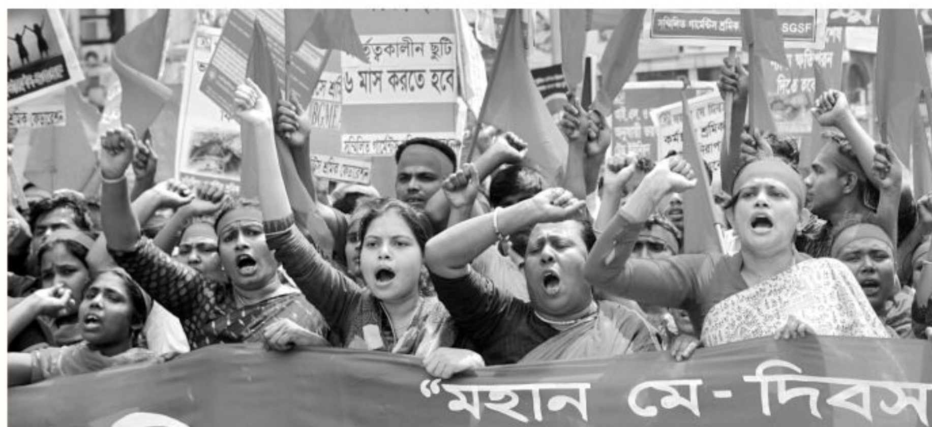
Sammilito Garment Sramik Federation, a garment workers' platform, brings out a procession in front of the Jatiya Press Club in the capital on Thursday marking the historic May Day.