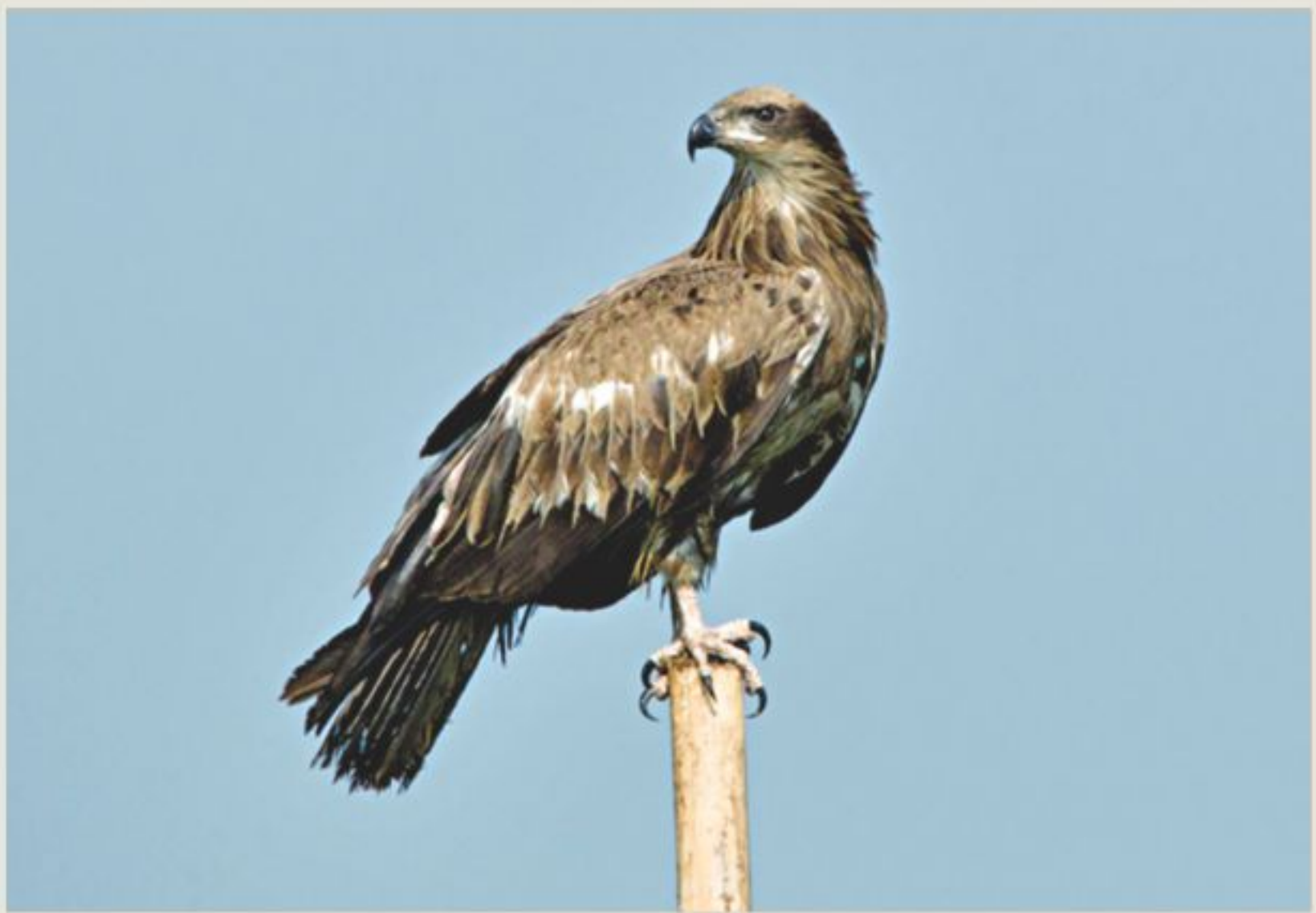
Pallas's Fish Eagle (juvenile).