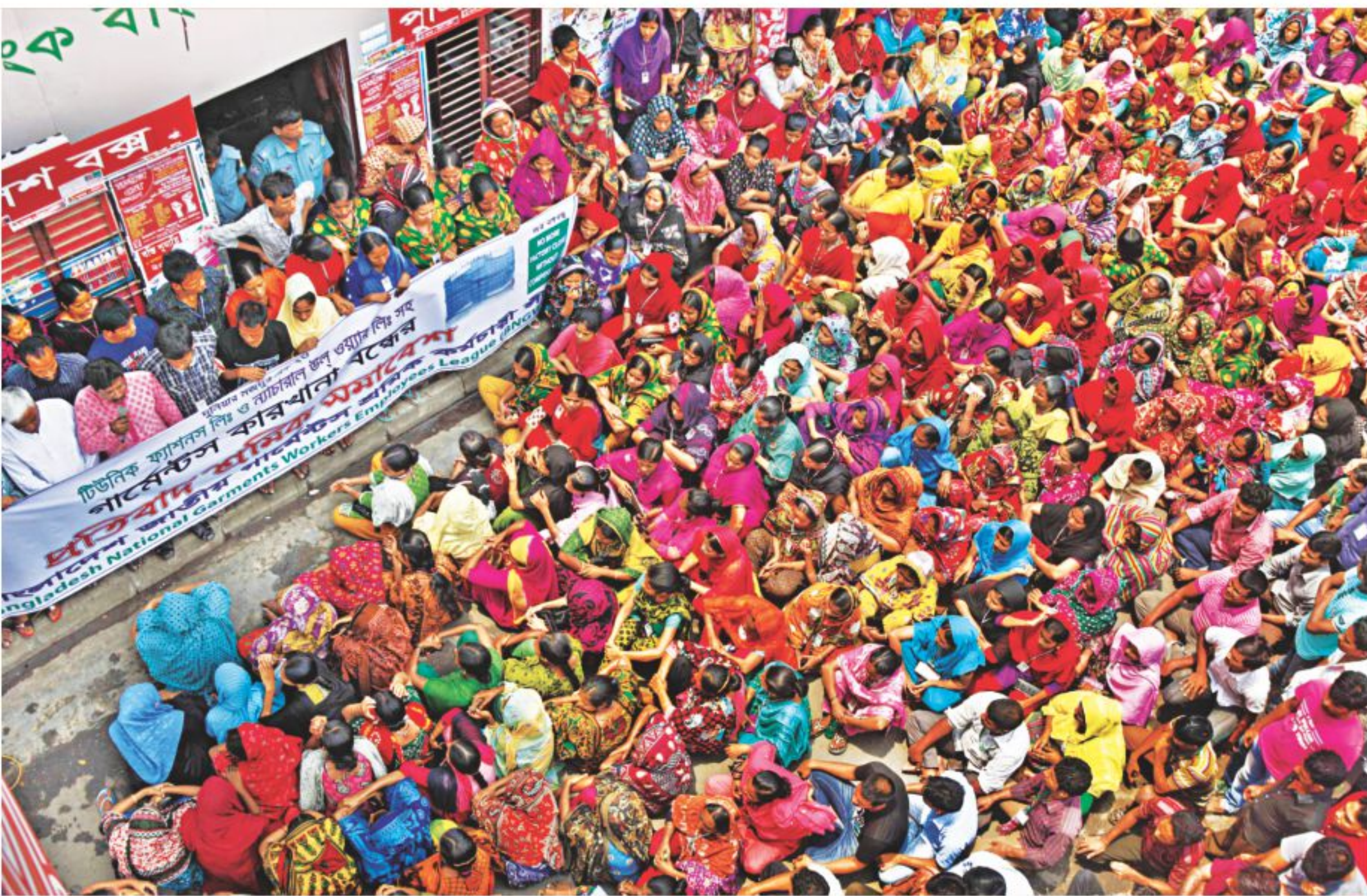
Garment workers join a sit-in programme to protest the shutdown of Tunic Fashions Ltd and Natural Wool Wear Ltd, in front of the National Press Club in Dhaka yesterday. The closures left about 2,000 workers jobless.