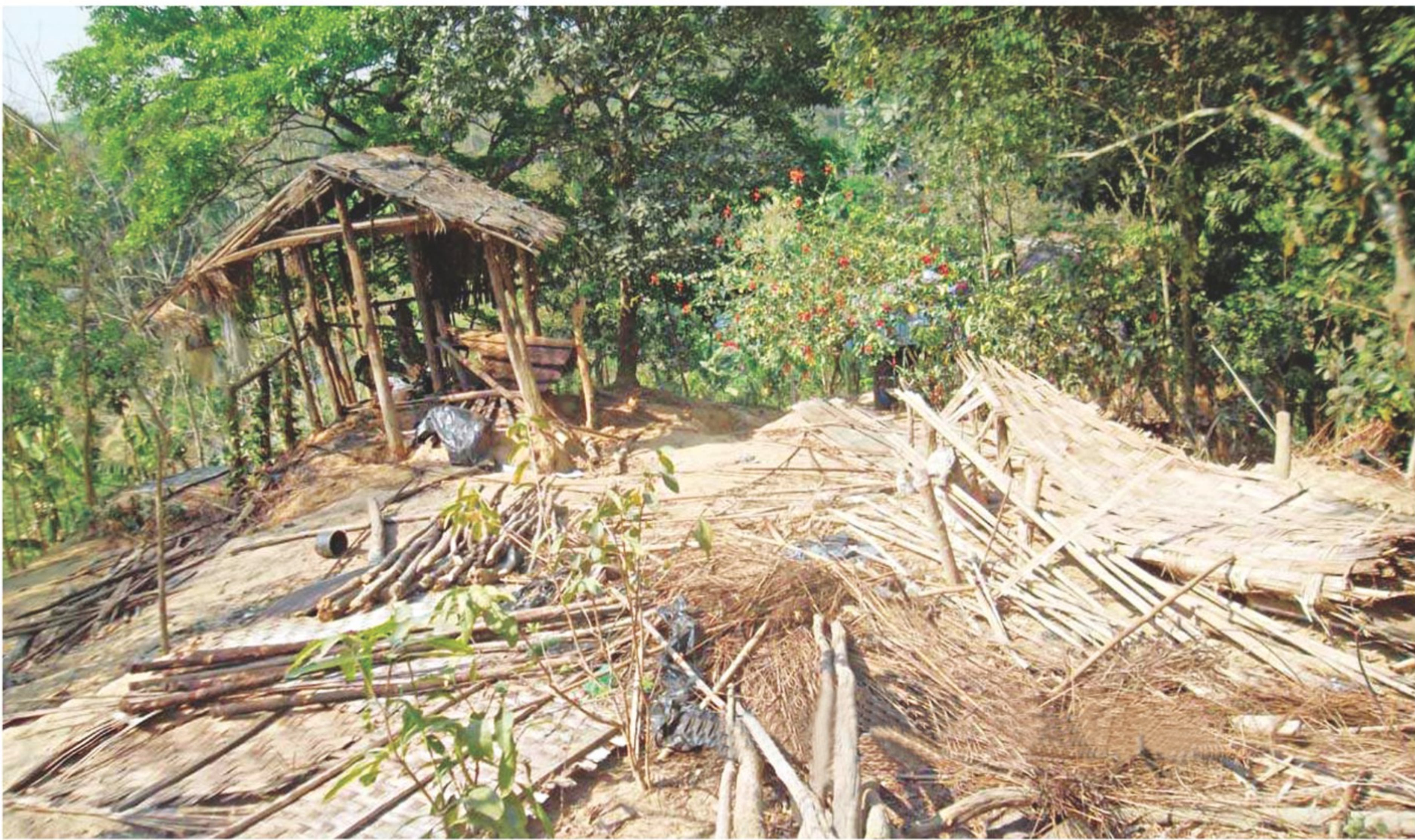
The ravaged home of a Marma family at Sapmara Jiri Marma Para village in Naikkhanchhari of Bandarban. Influential land grabbers have evicted several indigenous families there and vandalised their homes.