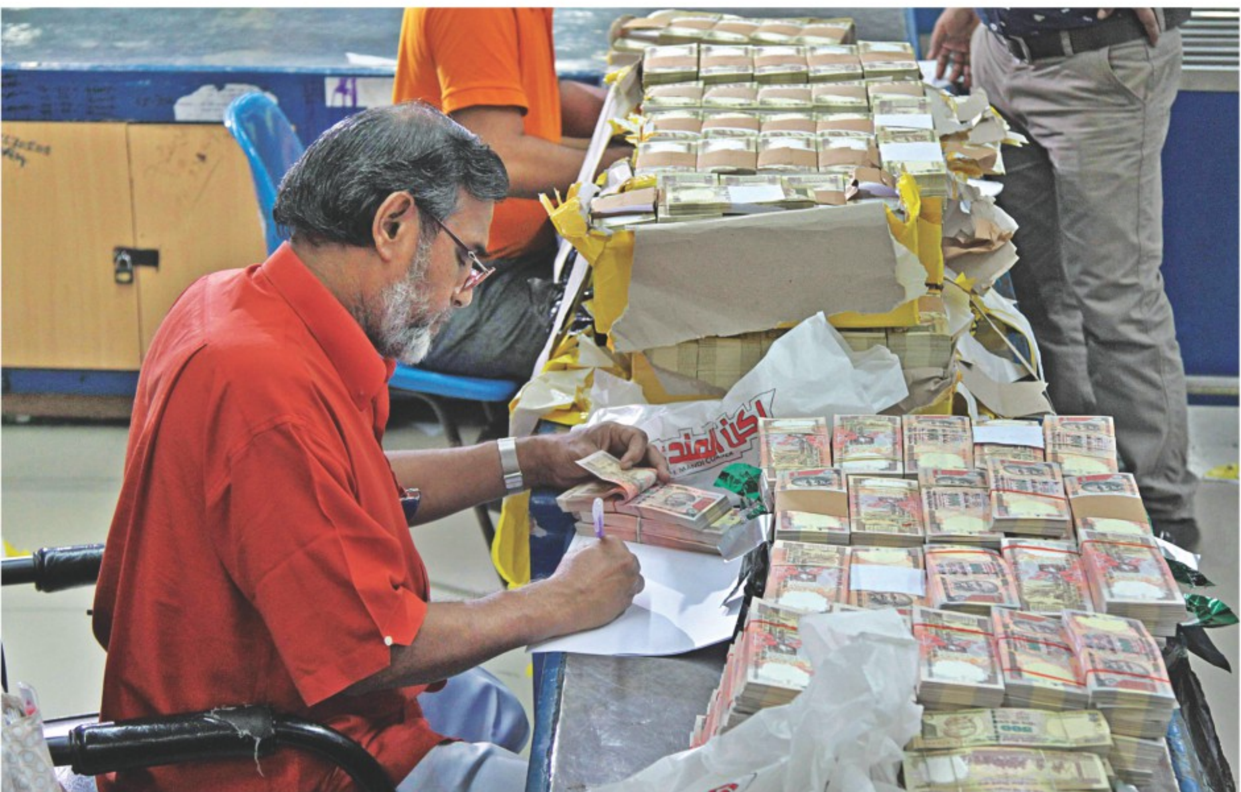
An official notes down the serial numbers of fake Indian rupees worth 6.40 crore at Shahjalal International Airport yesterday after the notes were discovered at the airport's cargo handling section.