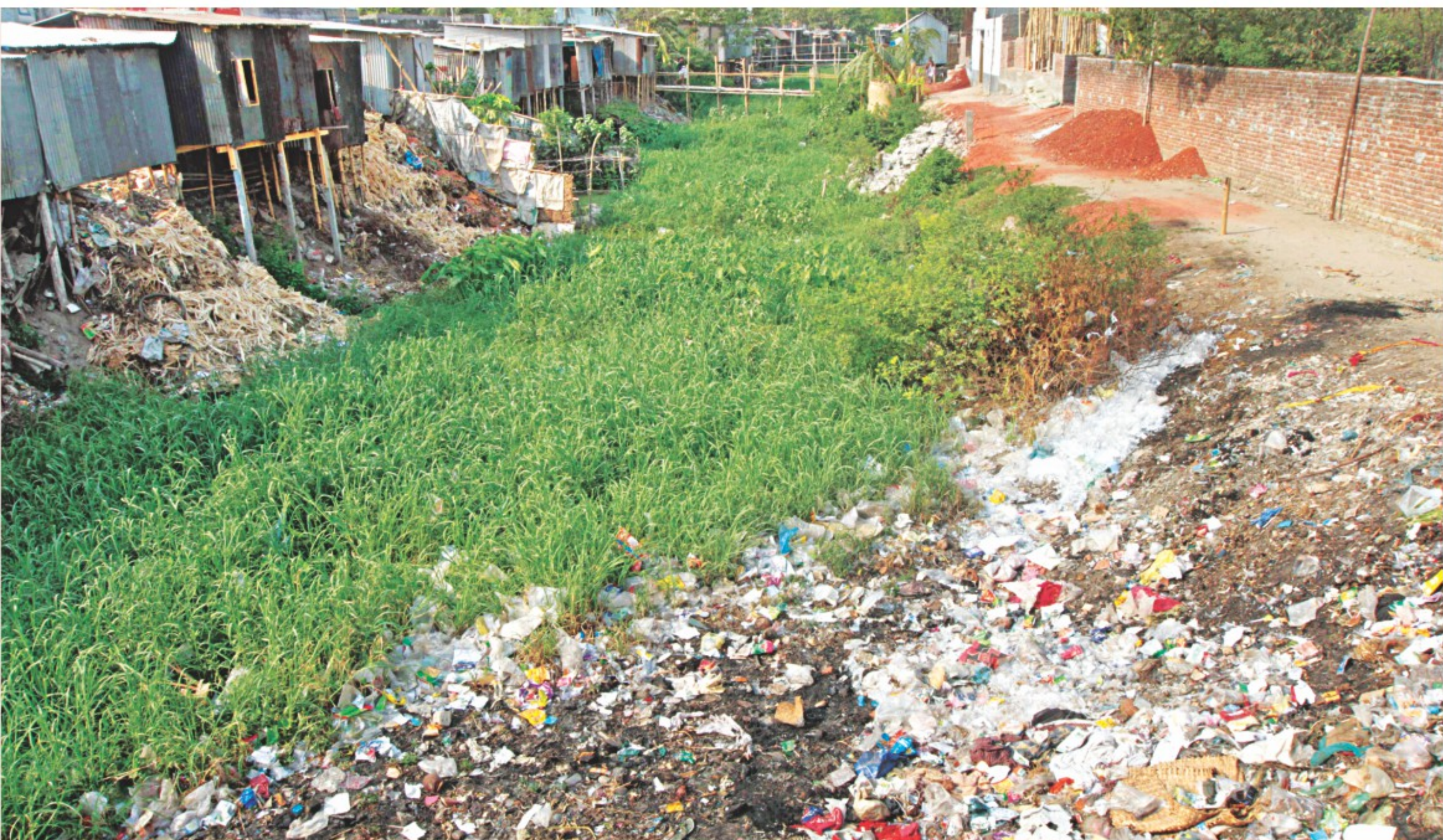
Believe it or not, this used to be a canal that would carry the rain and flood water from the capital's Basabo, Madartek, and Nandi Para areas to the Trimohoni river. What you see in this photo is the result of the utter neglect of the authorities concerned, putting the residents of the areas in the danger of severe waterlogging during the coming monsoon. This is only the tip of the iceberg that might lead the capital to ruins.