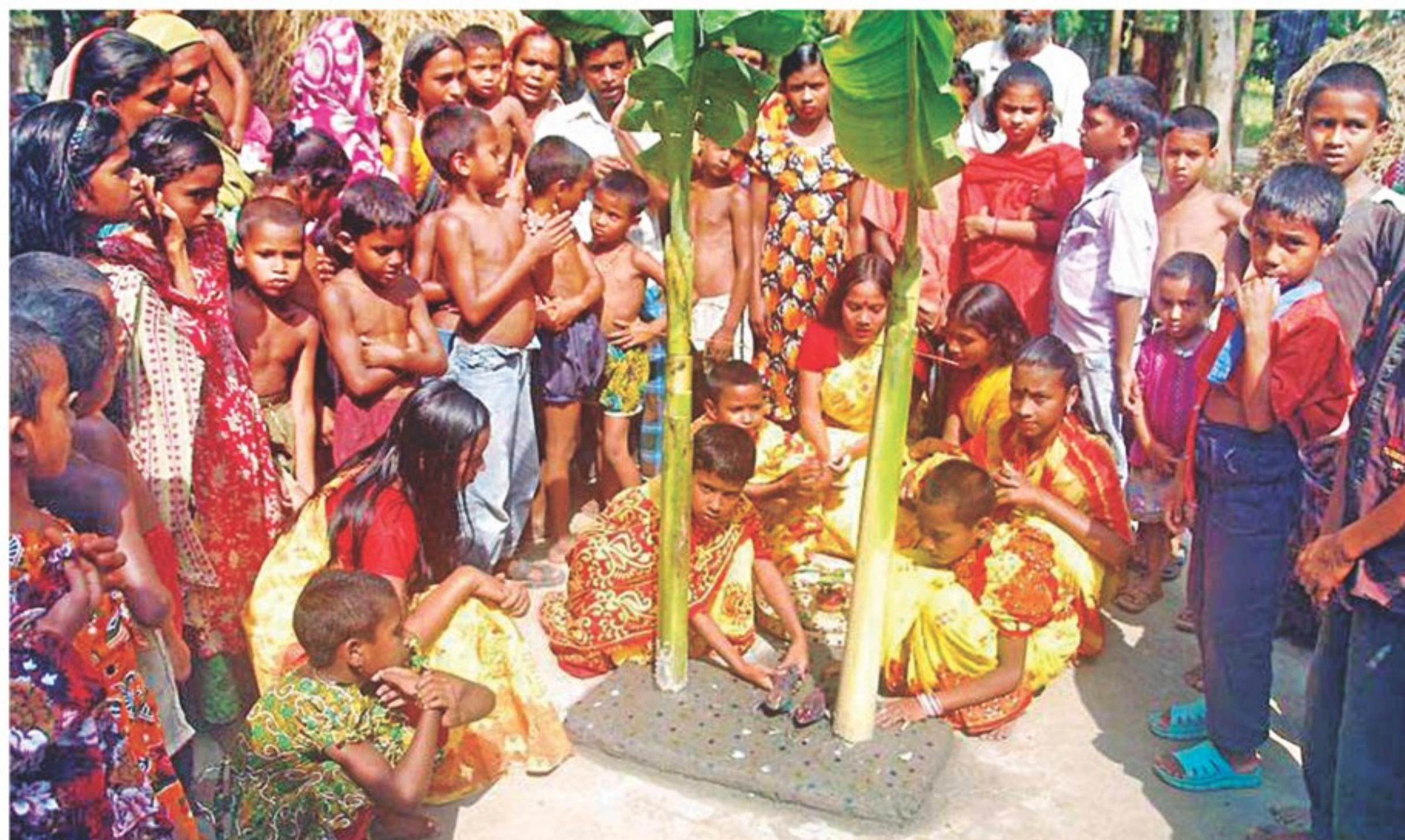
Tired of the prolonged dry spell, villagers of Bhatpara in Gaibandha get frogs "married off" in a unique custom seeking rain from the deity. The frogs were dressed in tiny clothes and people in colourful attire attended the "wedding" Friday afternoon.