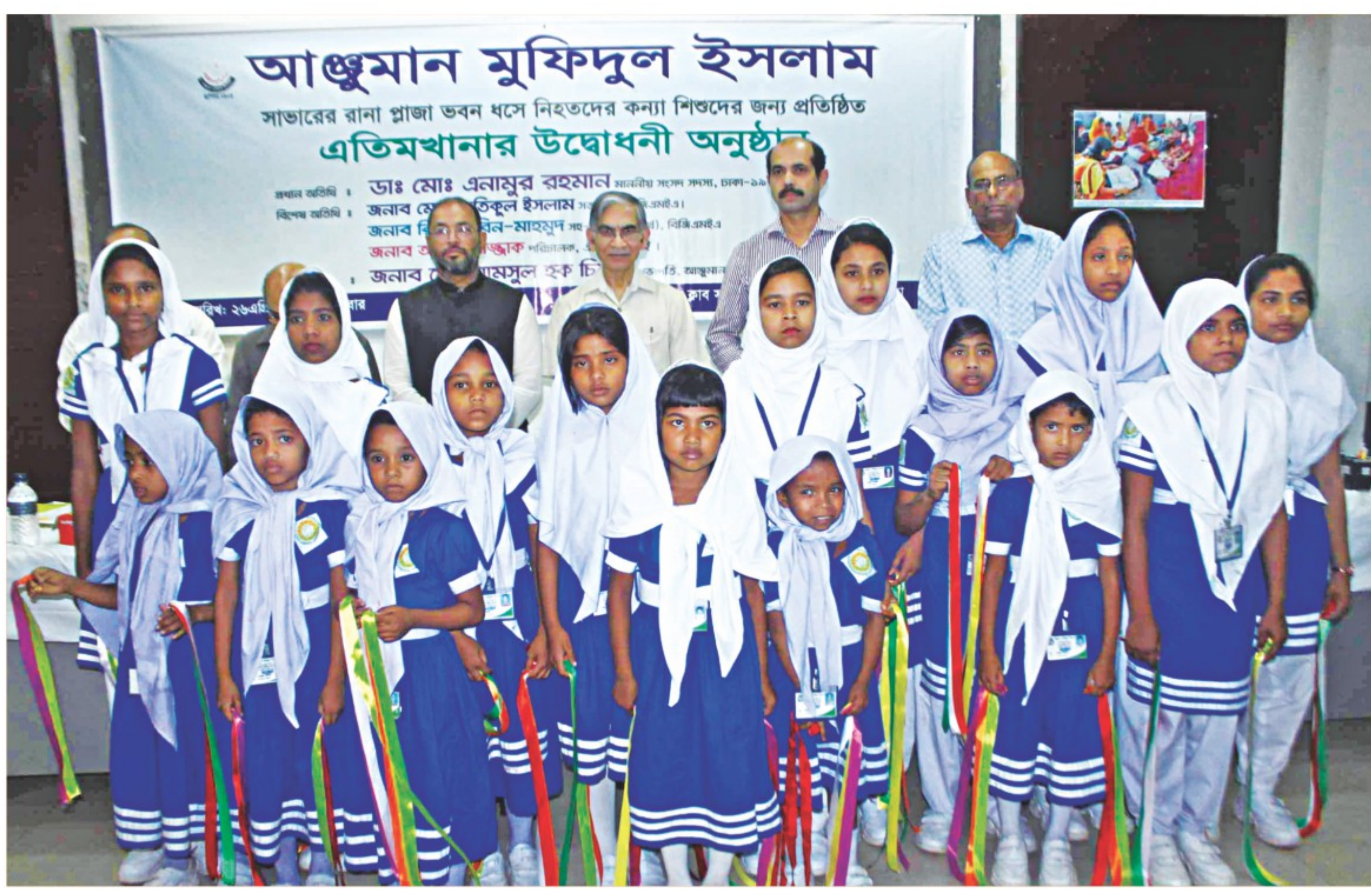
Sixteen students of Anjuman Azizul Islam Balika Home, which is rehabilitating children of the Rana Plaza victims, dead or injured, by providing shelter and education. They were taken from Savar, where the home is located, to the capital's Jatiya Press Club yesterday during the institution's inauguration.