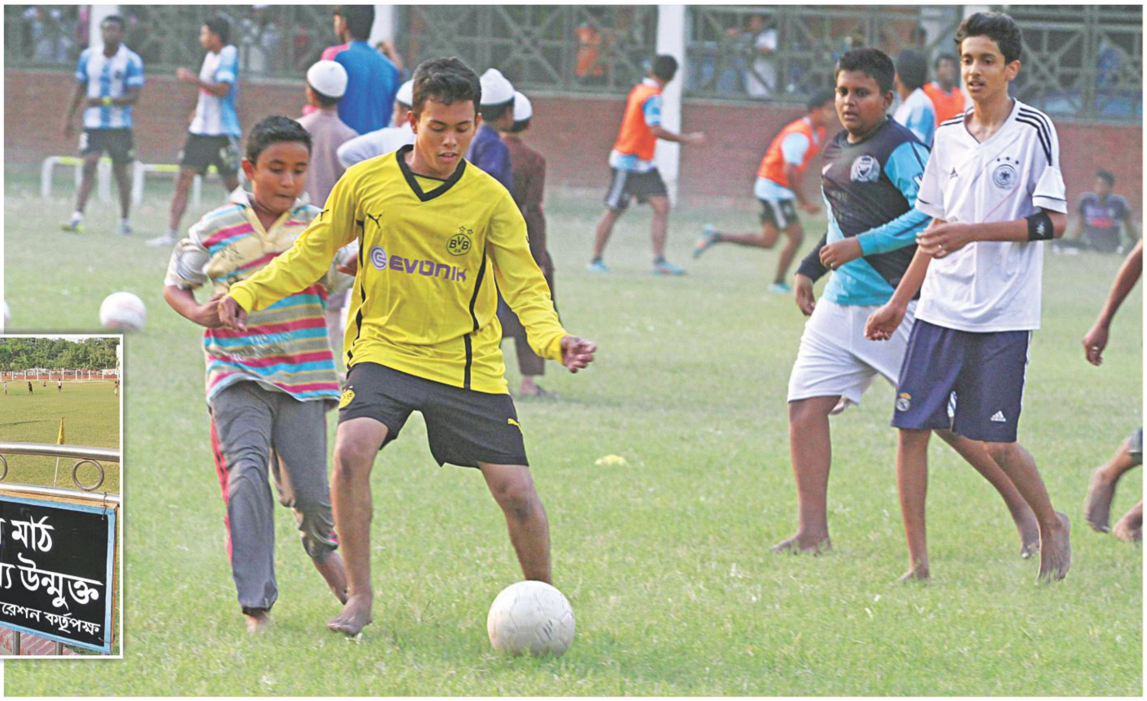
Children begin playing on the Dhanmondi playground yesterday as the Dhaka South City Corporation hung a notice on the gate, inset, opening the ground to all after two years.