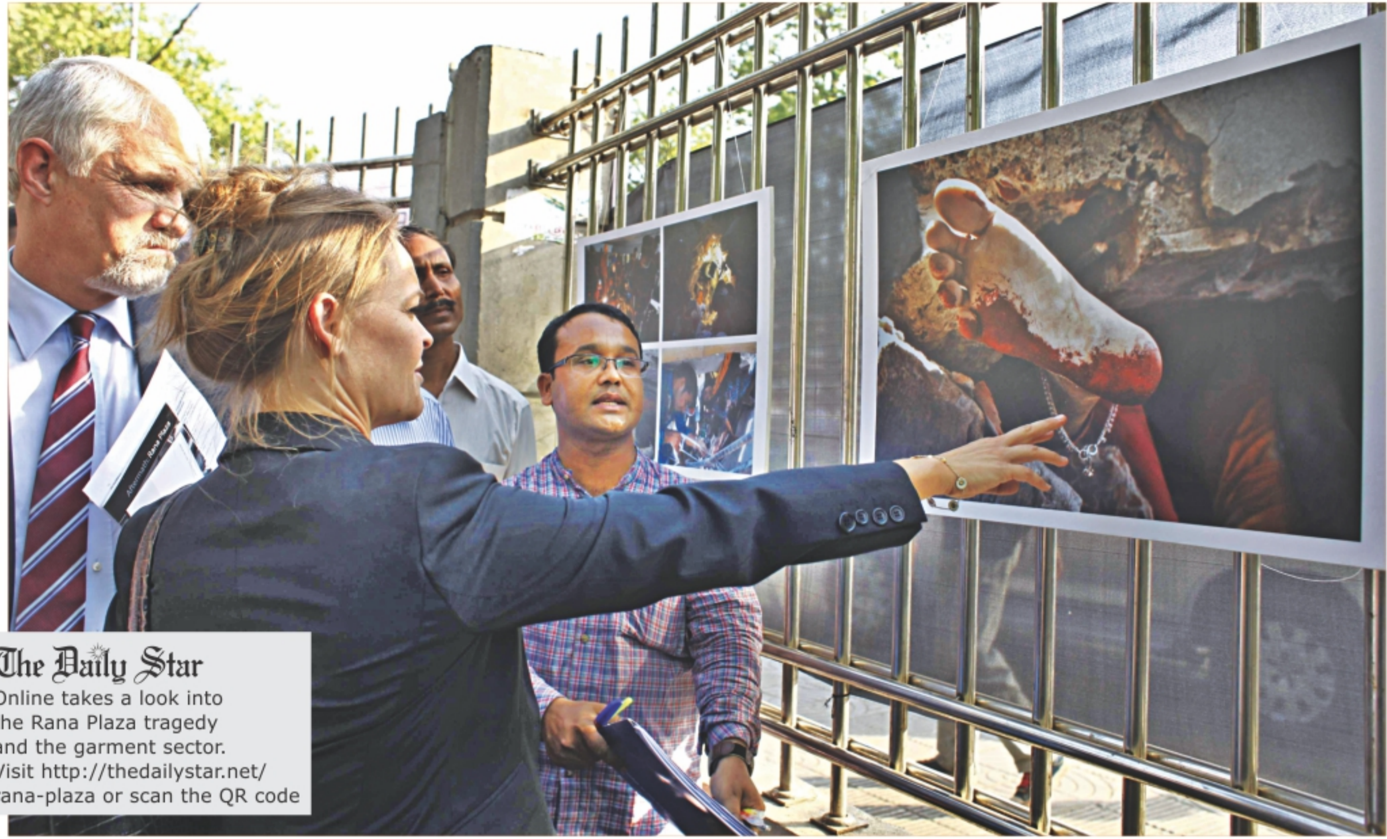
William Hanna, ambassador of EU delegation, and Denmark's envoy Hanne Fugl Eskjaer looking at a photo taken by The Daily Star's Rashed Shumon during an exhibition titled "Aftermath: Rana Plaza" in the capital yesterday.

The Daily Star Online takes a look into the Rana Plaza tragedy and the garment sector. Visit http://thedailystar.net/rana-plaza or scan the QR code