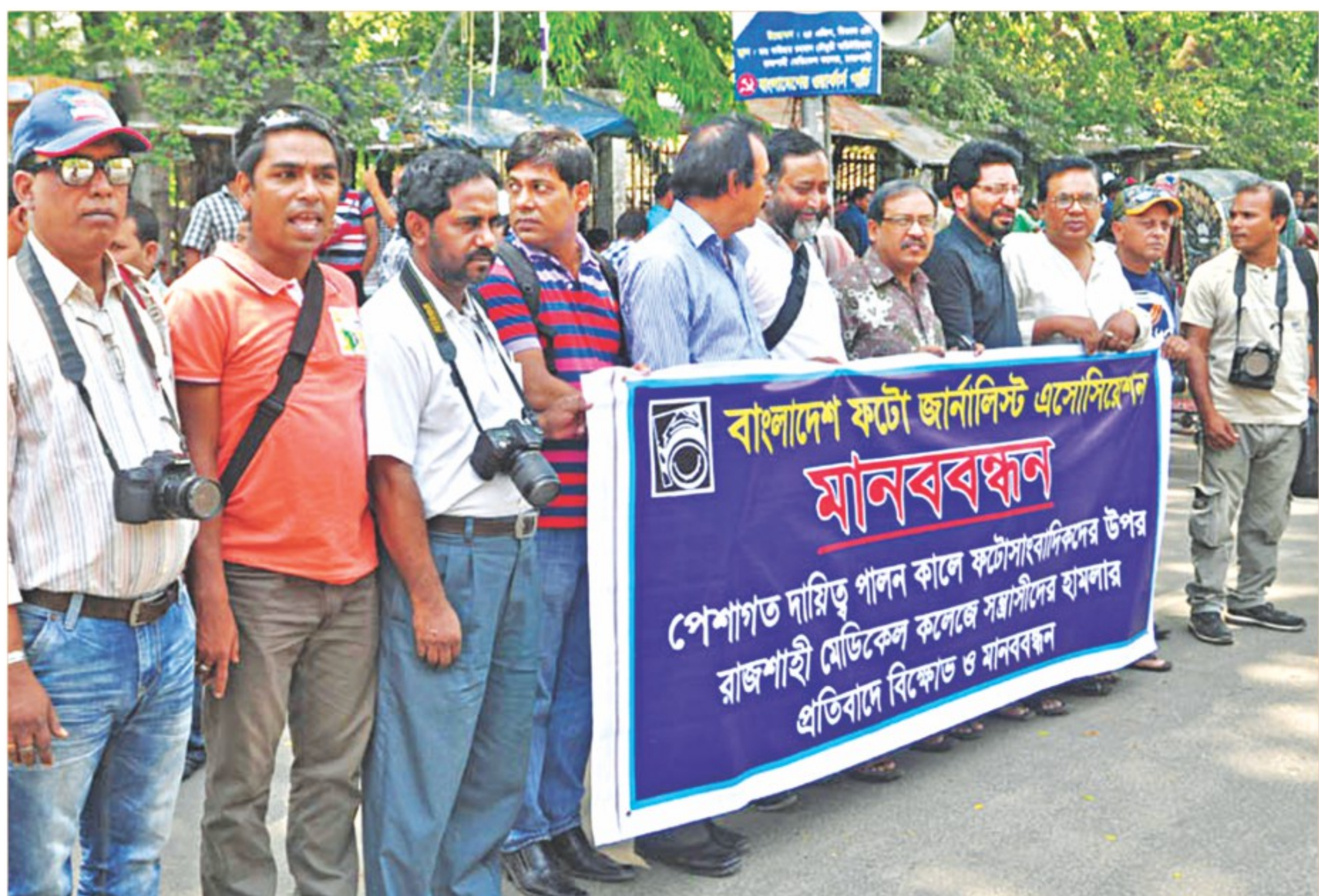
Bangladesh Photo Journalist Association forms a human chain in front of Jatiya Press Club in the capital yesterday protesting the attack on on-duty photojournalists at Rajshahi Medical College Hospital by the interns on Sunday.