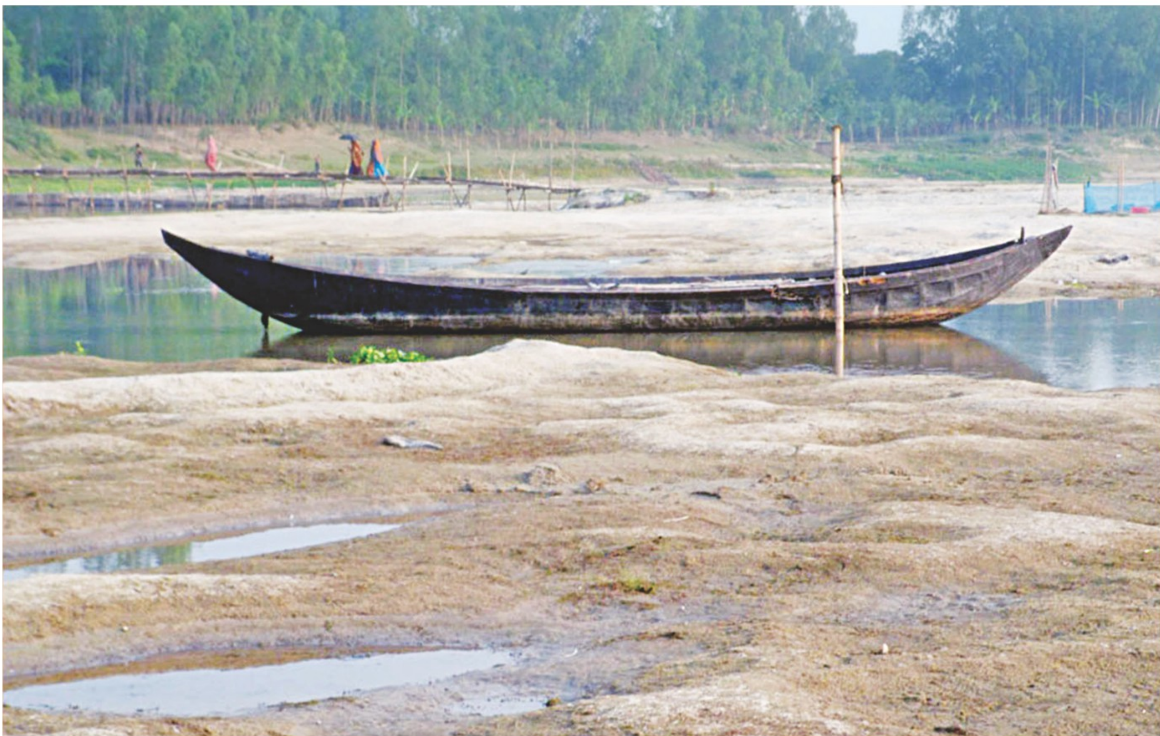
The Atrai river, which was once known as a rushing river, is now almost dead with water only coming up to knees due to poor maintenance and not receiving water from the source rivers Tista and Boral. The photo was taken at Buridah Char in Naogaon on Sunday.