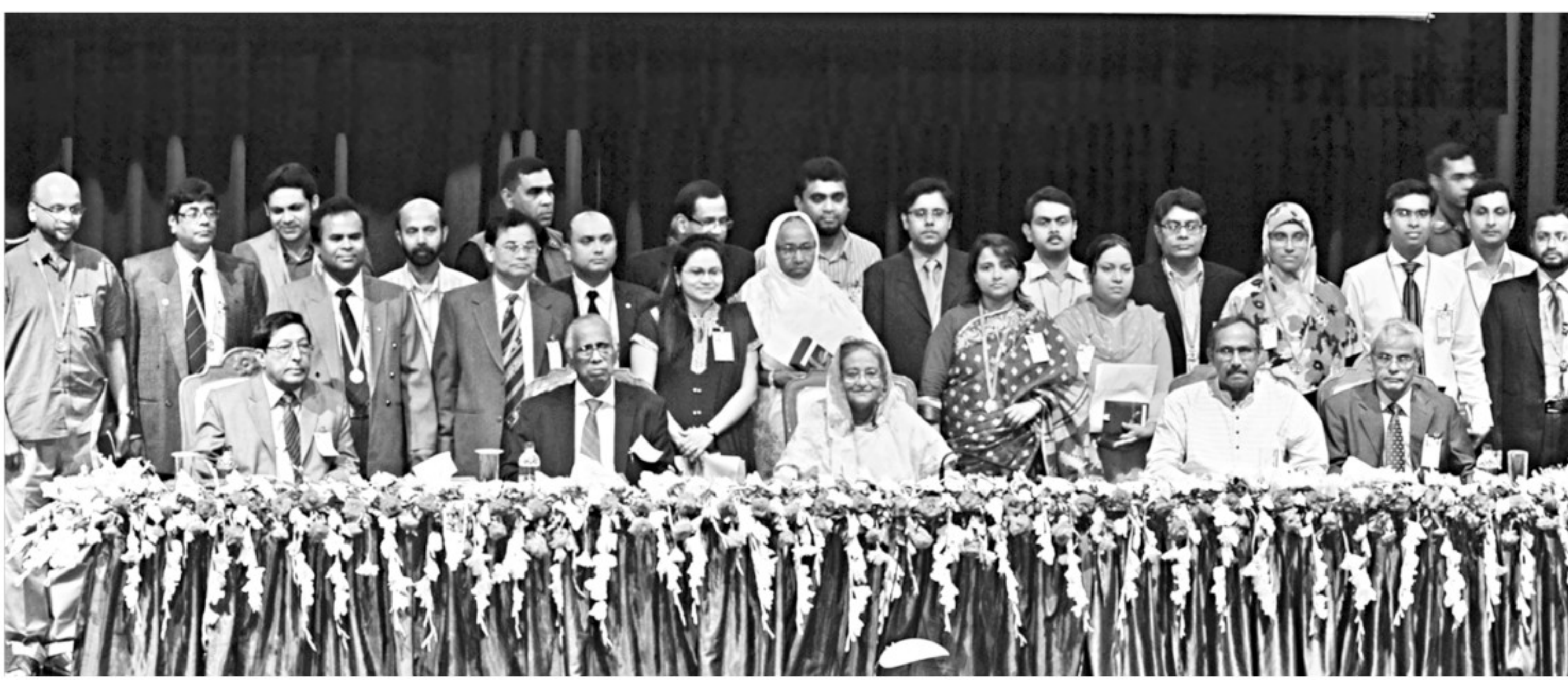
Prime Minister Sheikh Hasina with distinguished scientists who were awarded with gold medals for their contributions at a ceremony at Osmani Memorial Auditorium in the capital yesterday. Story on page 3.