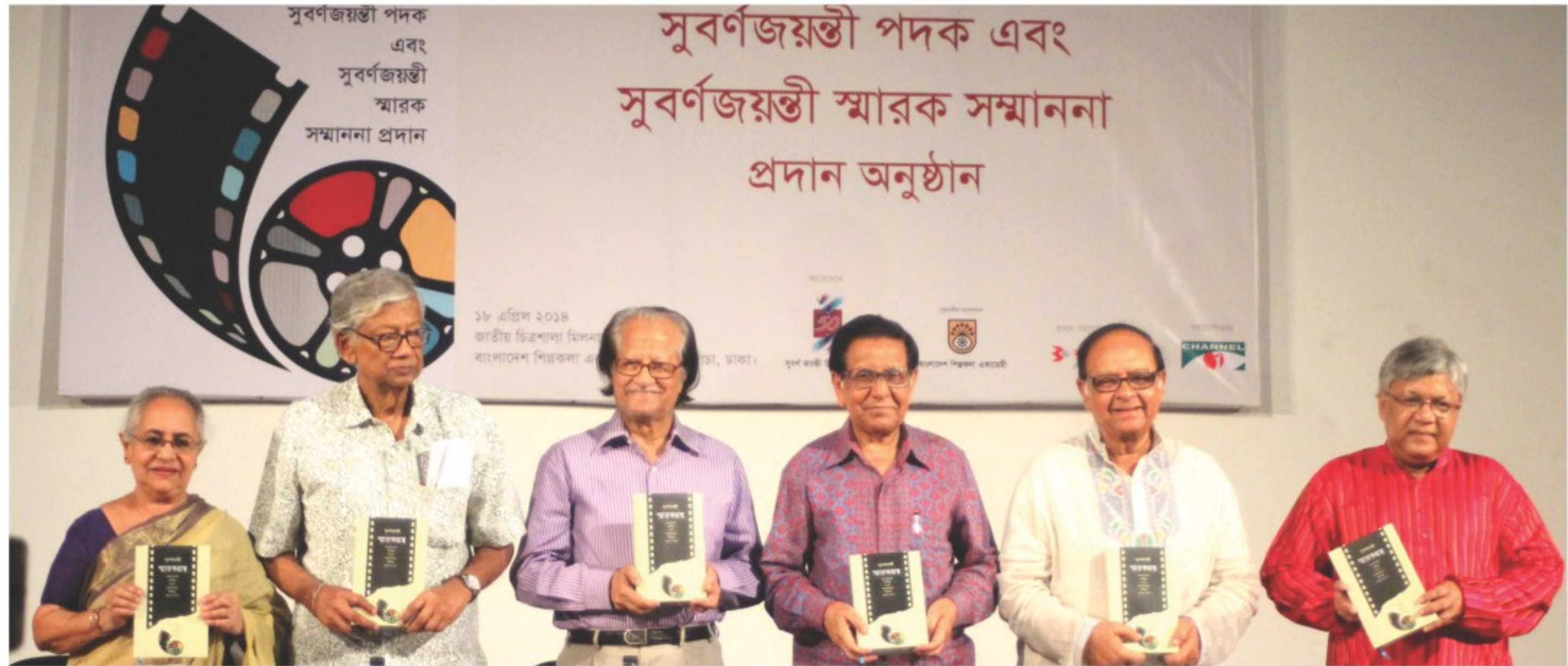
Guests unveil a book at the event.