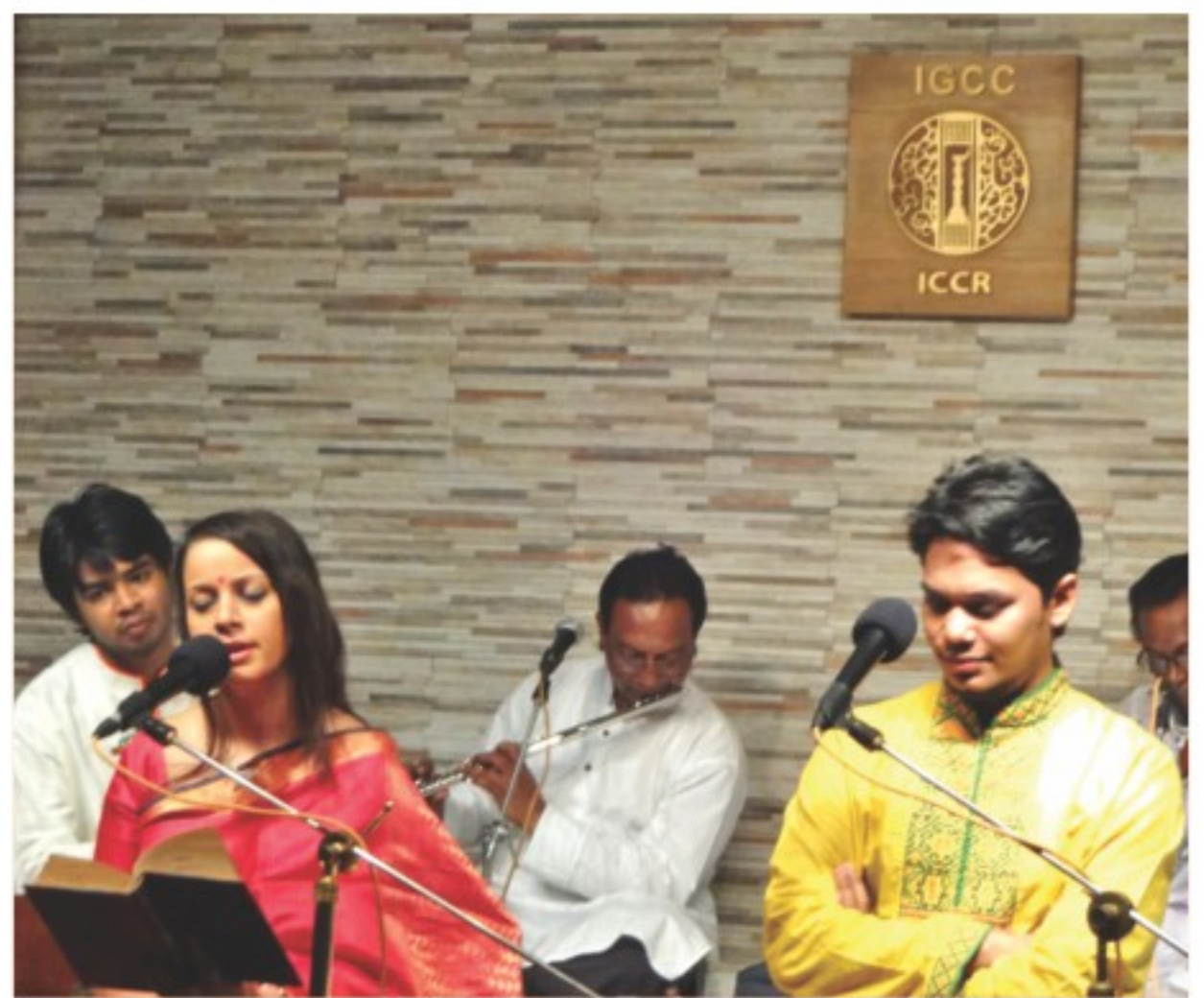
The artiste duo perform at the programme.

The event was organized in association with Asian Paints, IRCON and Marico Bangladesh.