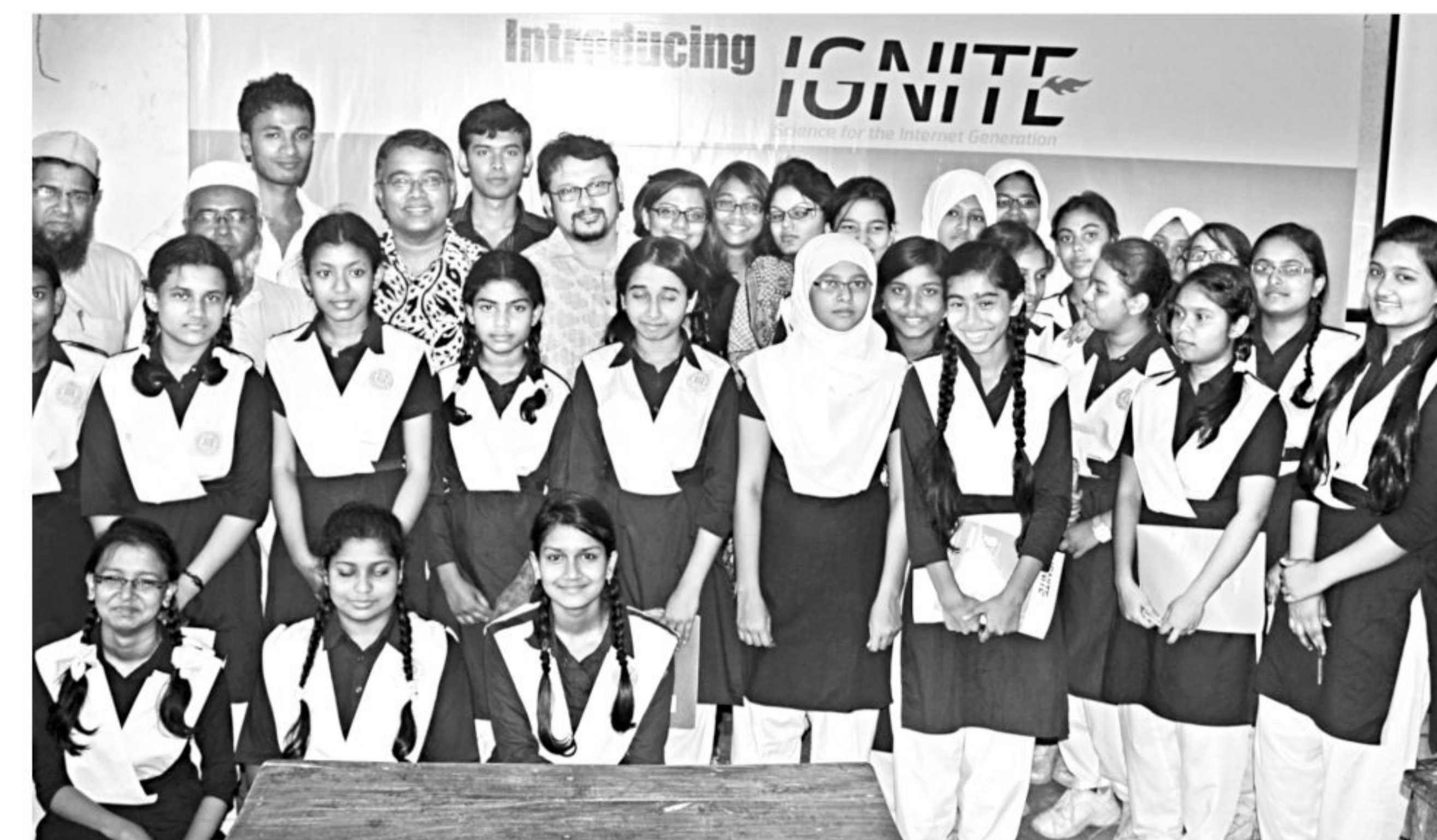
Moderators and participants at Introducing IGNITE, activation programme of The Daily Star-Grameenphone event IGNITE, a science competition for school students, at Engineering University Girls' High School in the capital yesterday.