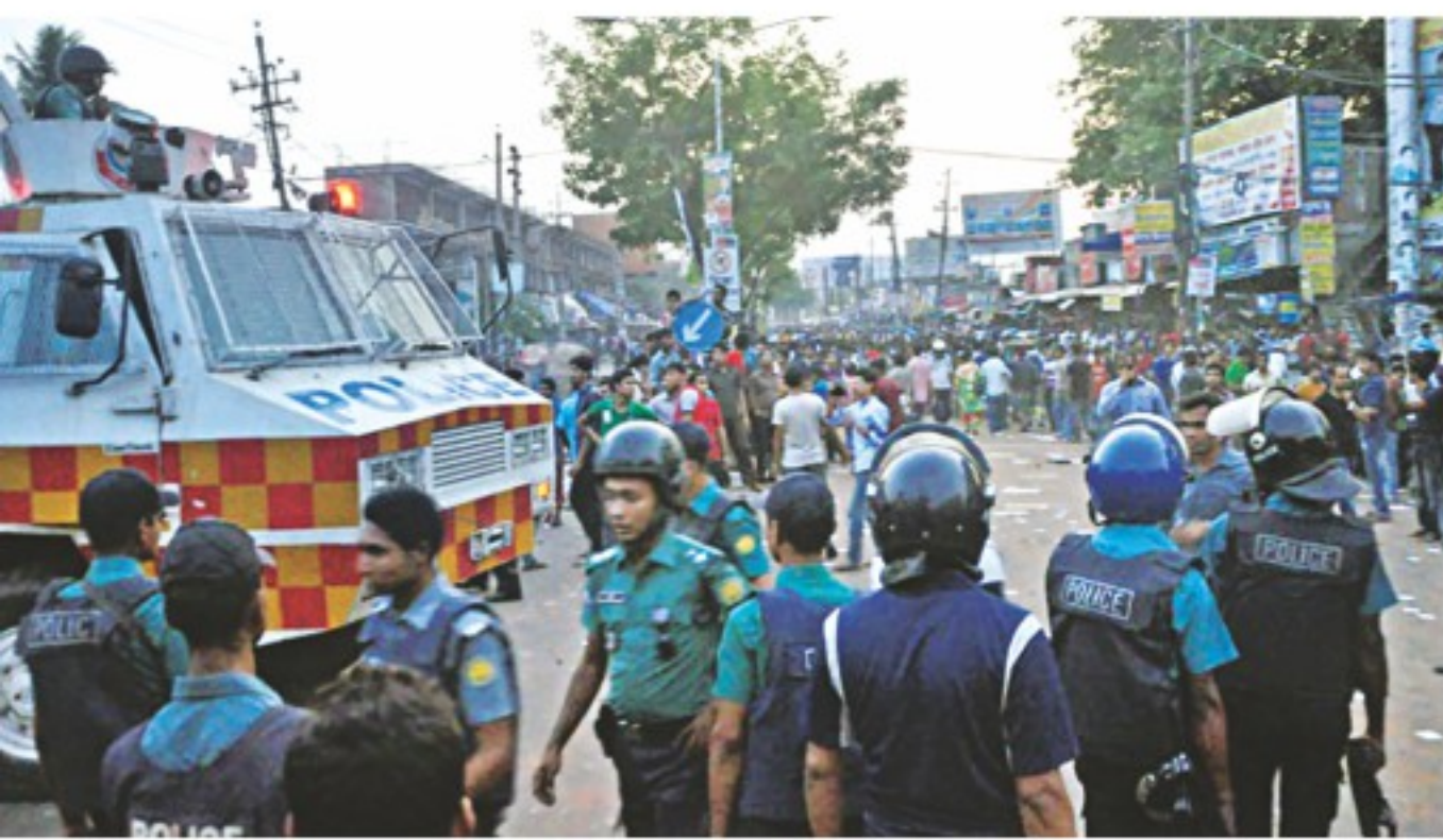
Books of street vendors at Nilkhet in the capital burn during a clash between the shopkeepers and students of Dhaka University yesterday. The clash ensued after a shop owner beat up a student of the university during an altercation over returning of a book. Inset , police with a riot car trying to control the situation.