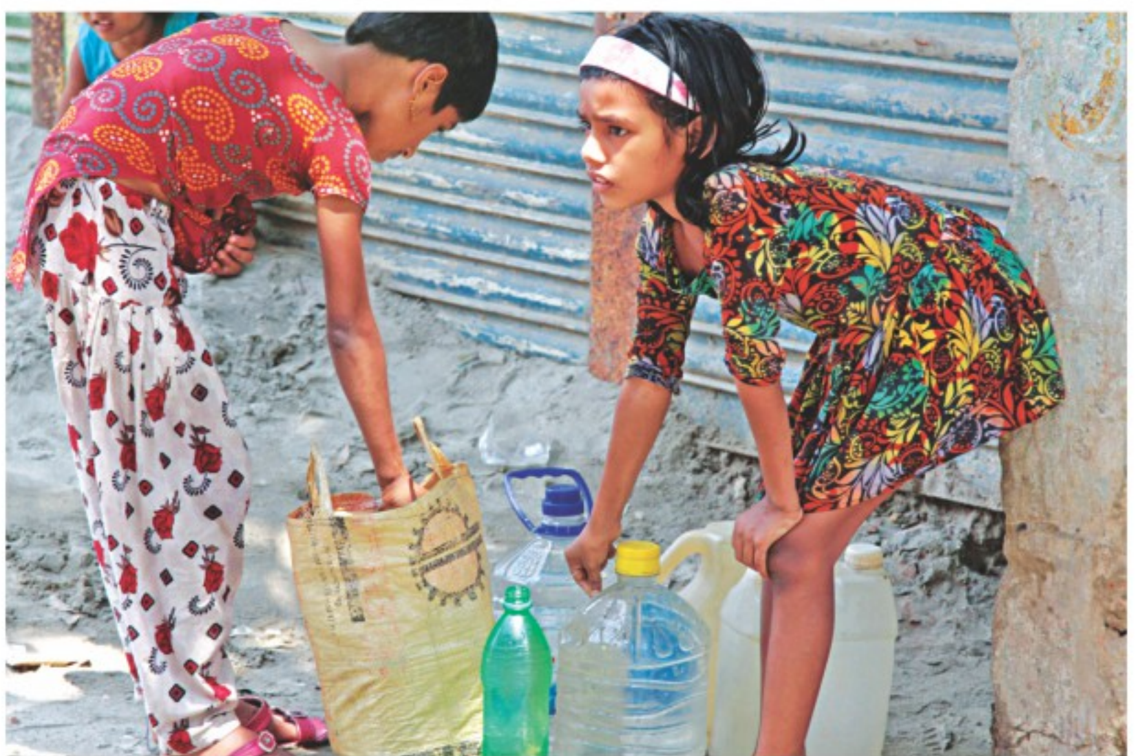
Pitchers, cans and bottles are queued up at a tap of a Wasa pump station at Goran in the capital yesterday. People of Goran, Madertek and Bashabo have been lining up here for water for the last three years as the water supplied to their homes reeks. The supplied water can be used for washing up things but cannot be used for drinking. Top right , a woman holding a child takes water home on a rickshaw. Bottom right , children pause to rest as they take bottles and cans of water home from the pump station.