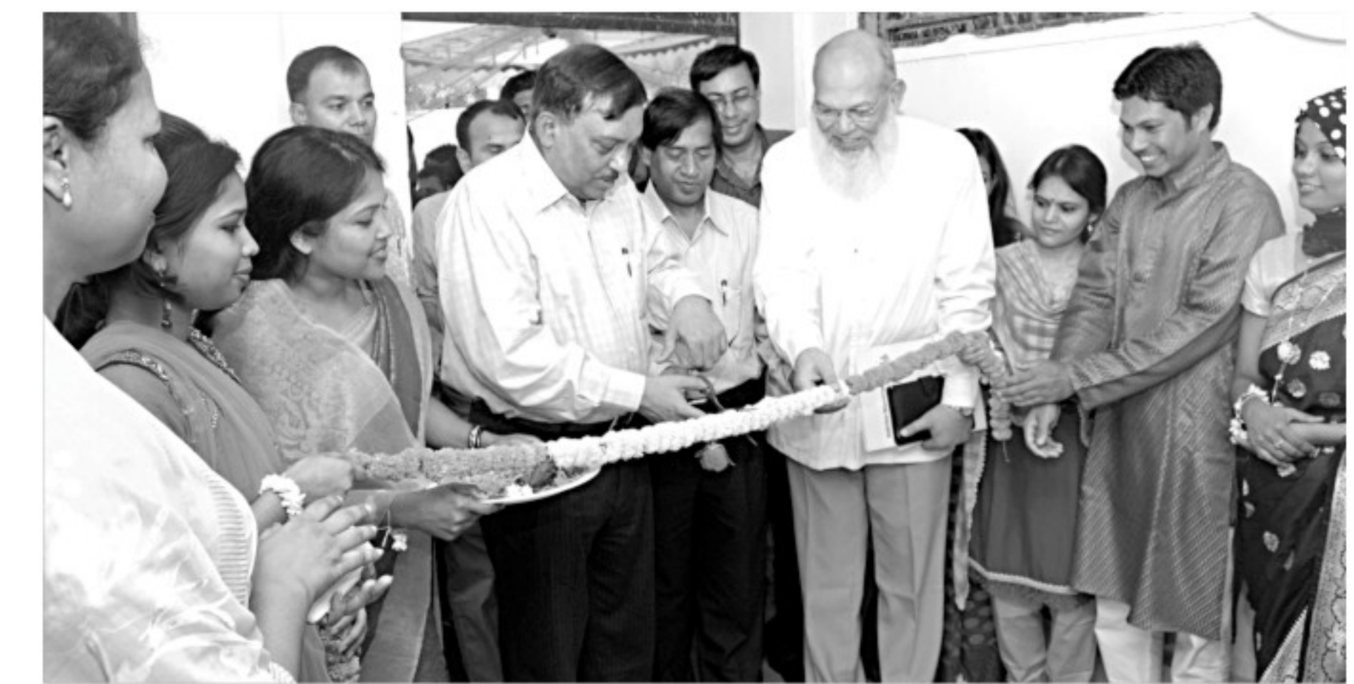
State Minister for Home Asaduzzaman Khan Kamal inaugurates a 25-bed Female Drug Treatment and Rehabilitation Centre of the Dhaka Ahsania Mission on Iqbal Road in the capital's Mohammadpur yesterday. DAM President Kazi Rafiqul Alam, among others, was present at the inaugural programme.

He also added that the High Court on October 26, 2011 had directed the government to remove illegal structures in and around the Lalbagh Fort to protect its beauty, nature and archaeological heritage.