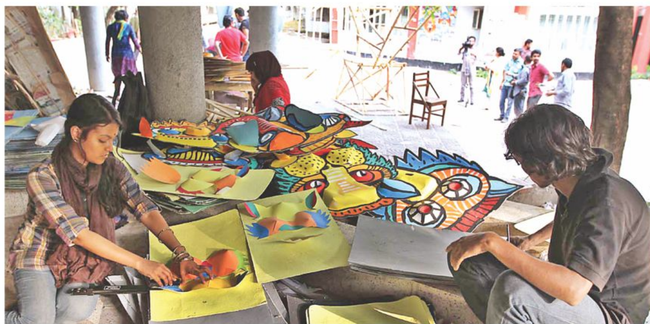
Students of Institute of Fine Arts, CU, busy in preparation of Mongol Shobhajatra.