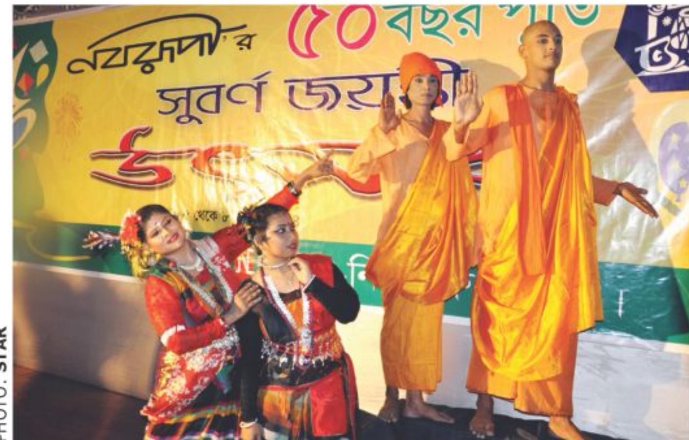
A scene from Tagore play "Chandalika" staged on the closing day.