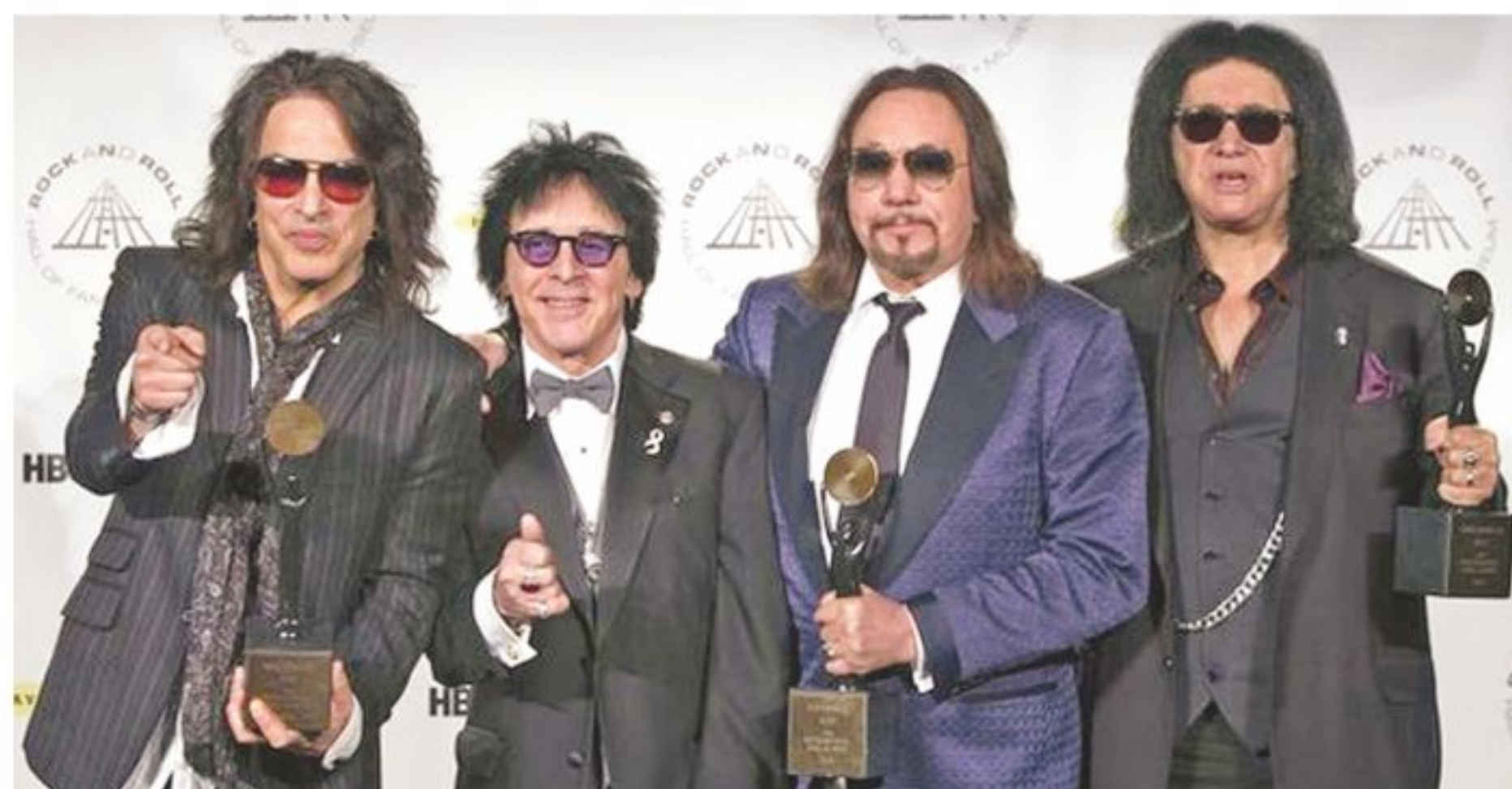
Kiss accepted their awards without their trademark face paints: (L-R) Paul Stanley, Peter Criss, Ace Frehley and Gene Simmons.

Nirvana received their place in the Hall of Fame in their first year of eligibility.