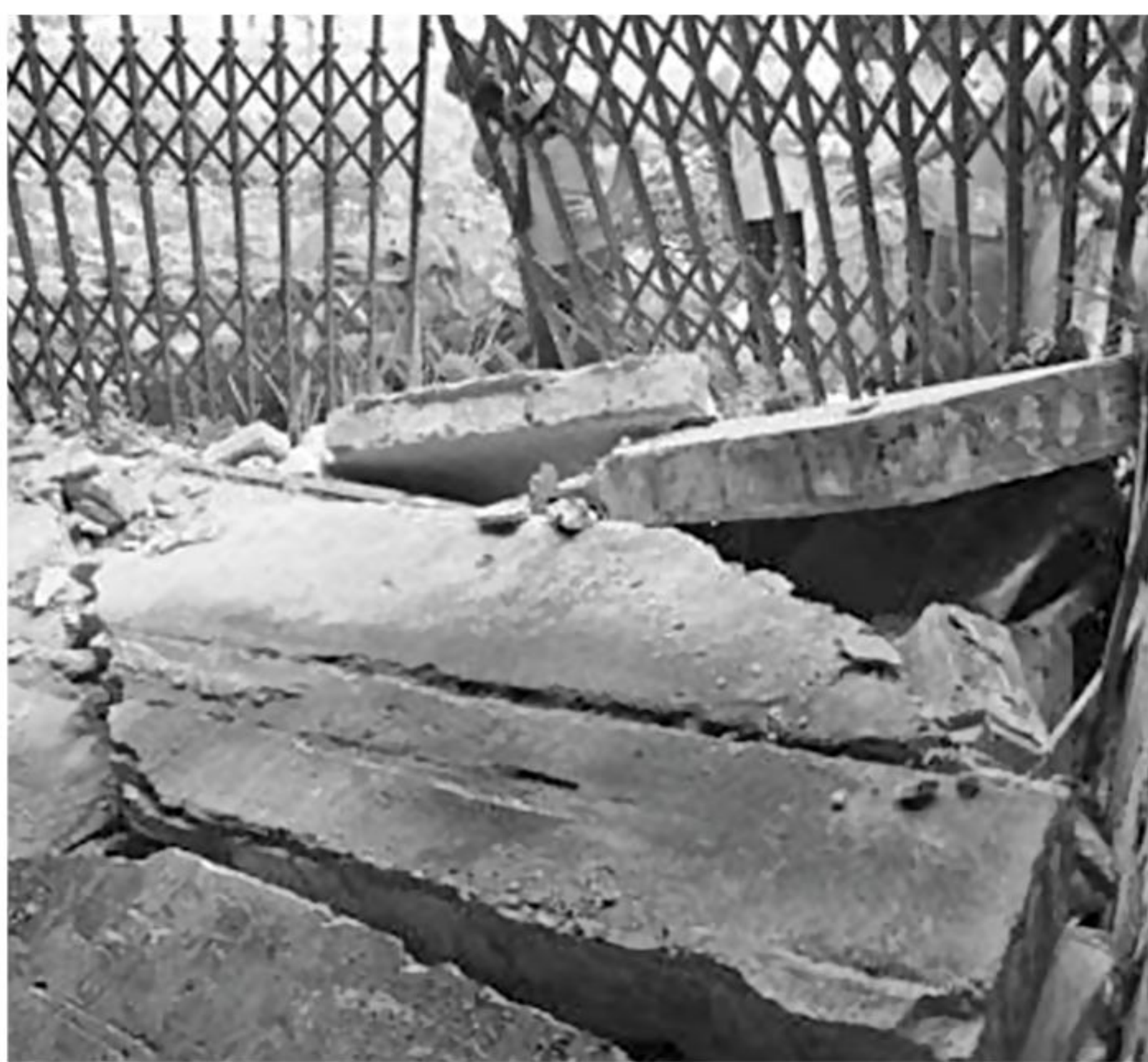
The wall of the canteen of District and Sessions Judge's Court in Munshiganj town collapsed yesterday noon, leaving two lawyers seriously injured.