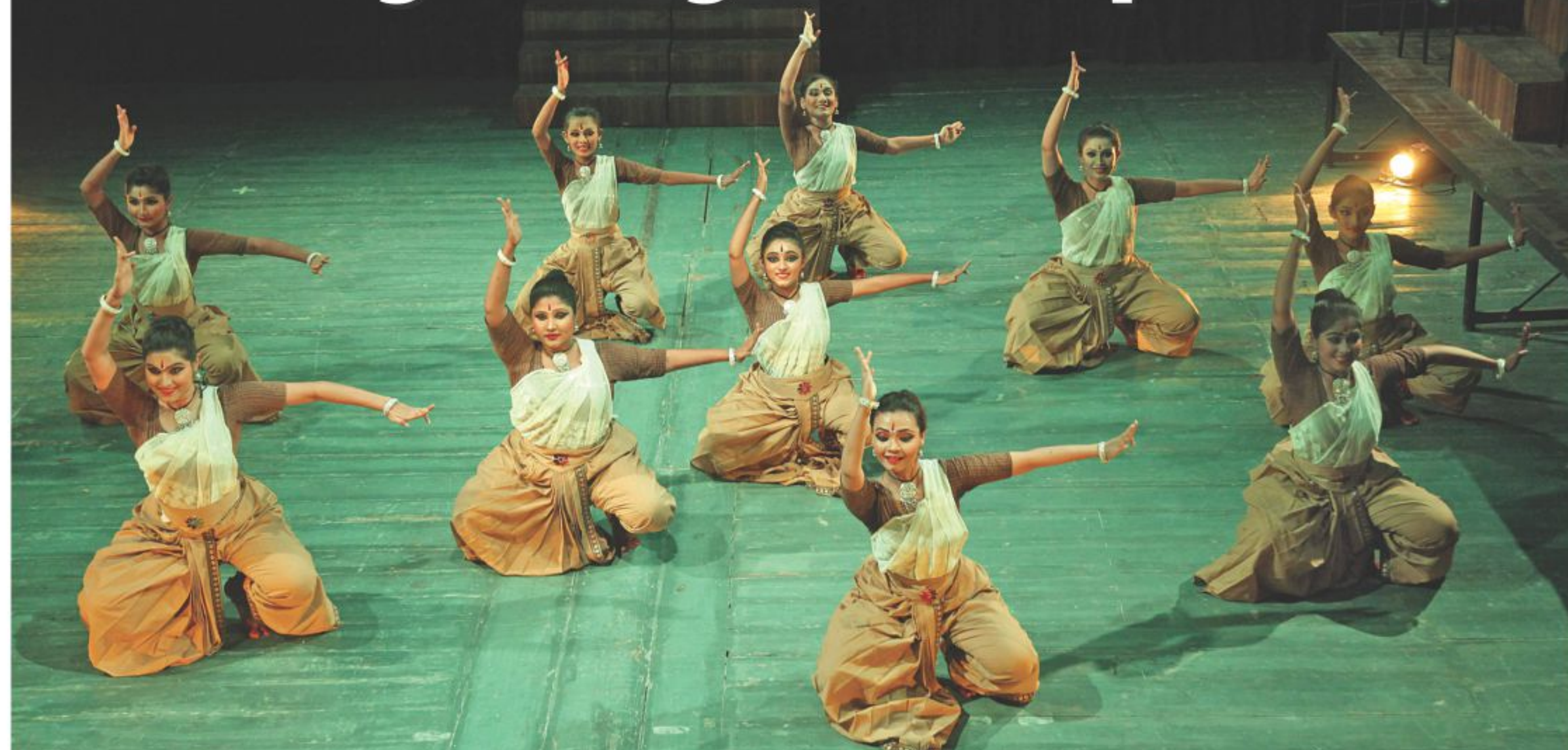
Pallavi premieres "Bishmaye Jagey Pran" at Shilpakala.

Pallavi Dance Centre, in association with US Embassy in Dhaka, premiered their latest production "Bishmaye Jagey Pran" at Experimental Theatre Hall of Bangladesh Shilpakala Academy on April 8. Based on Tagore songs and poetic verses, the production featured five elements of nature, known in Sanskrit as Panchabhuta -- earth, water, fire, wind and ether (or space). Their presence is felt in God's creations being the constituent of all physical, sensual, mental and spiritual phenomena. In cohesion