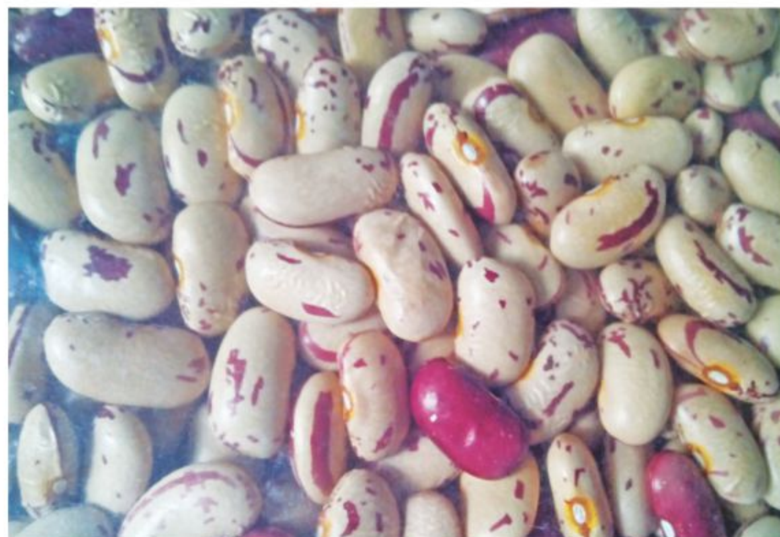
Left photo, the world's first biologically fortified (biofortified) zinc-enriched rice BRR1 dhan62. Developed by Bangladeshi scientists, it will go to farmers in large scale from coming Aman season. Right photo, biofortified beans, first released in Rwanda in 2010. Half of 1.2 million Rwandese farm families now grow this bean which is rich in iron content.