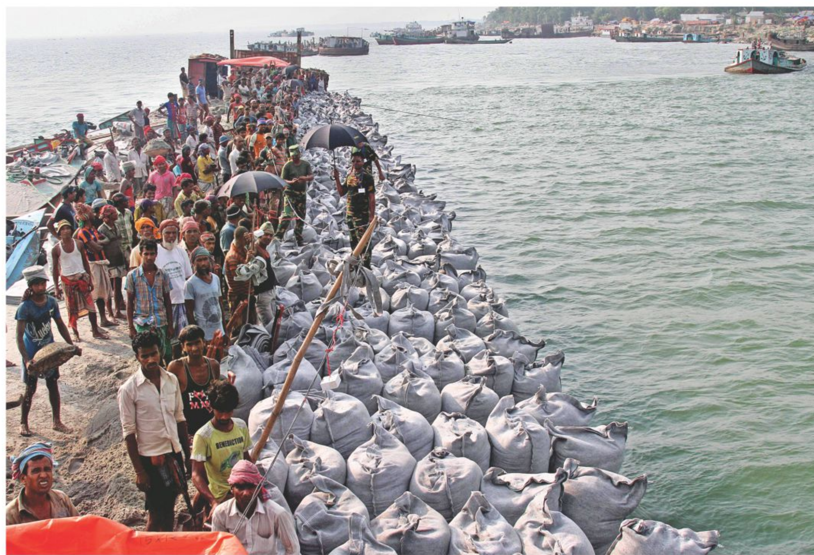
Workers dump sandbags in the Padma at Mawa in Munshiganj yesterday. Under the Padma bridge project, the army is supervising the job to prevent river bank erosion. At least 2,000 labourers are engaged in the work beginning on March 25. Right photo, a portion of the bank damaged by the Padma.