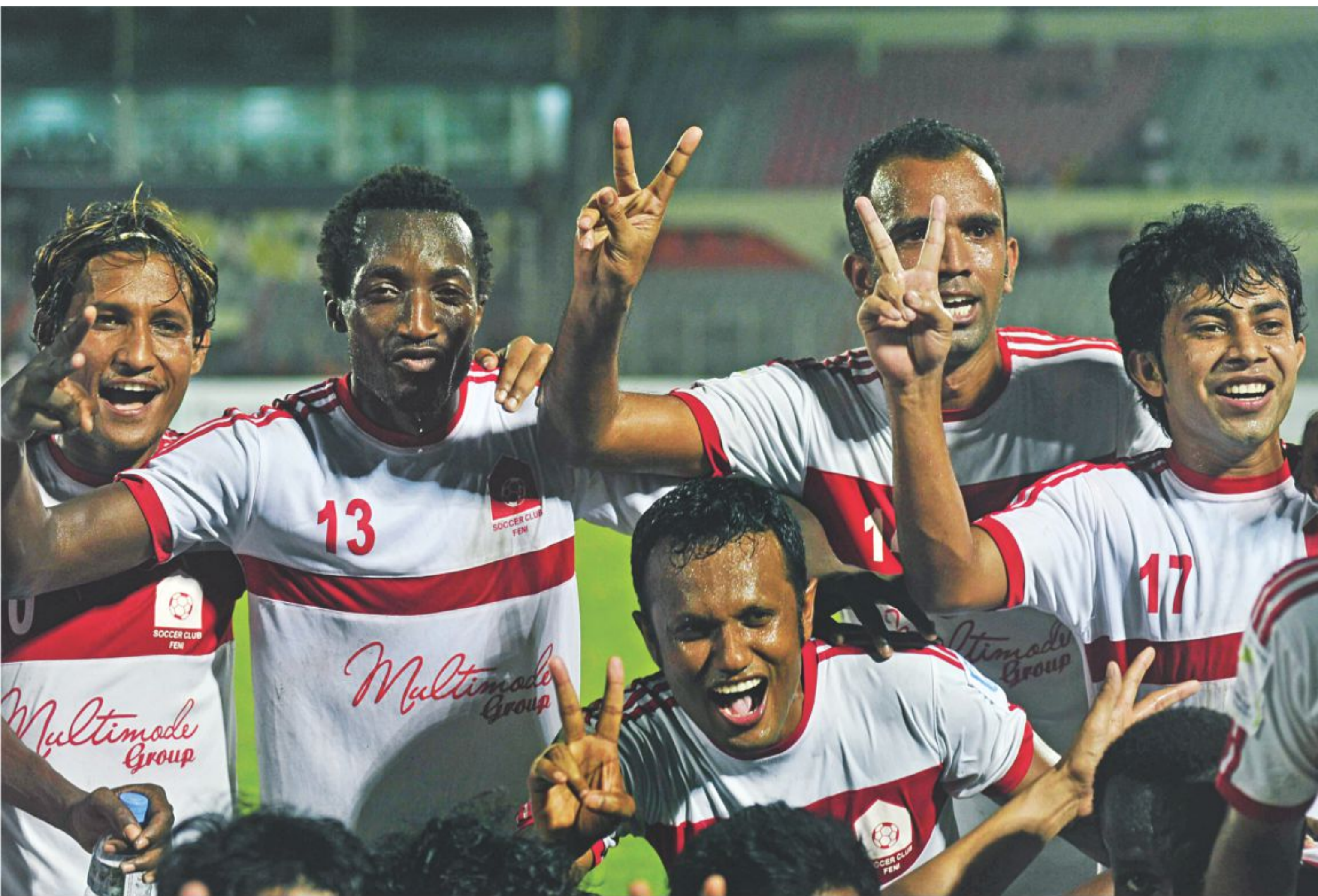
Players of Feni Soccer Club celebrate their maiden passage into a domestic tournament final after their 2-0 semifinal victory over Brothers Union in the Independence Cup at the Bangabandhu National Stadium yesterday.