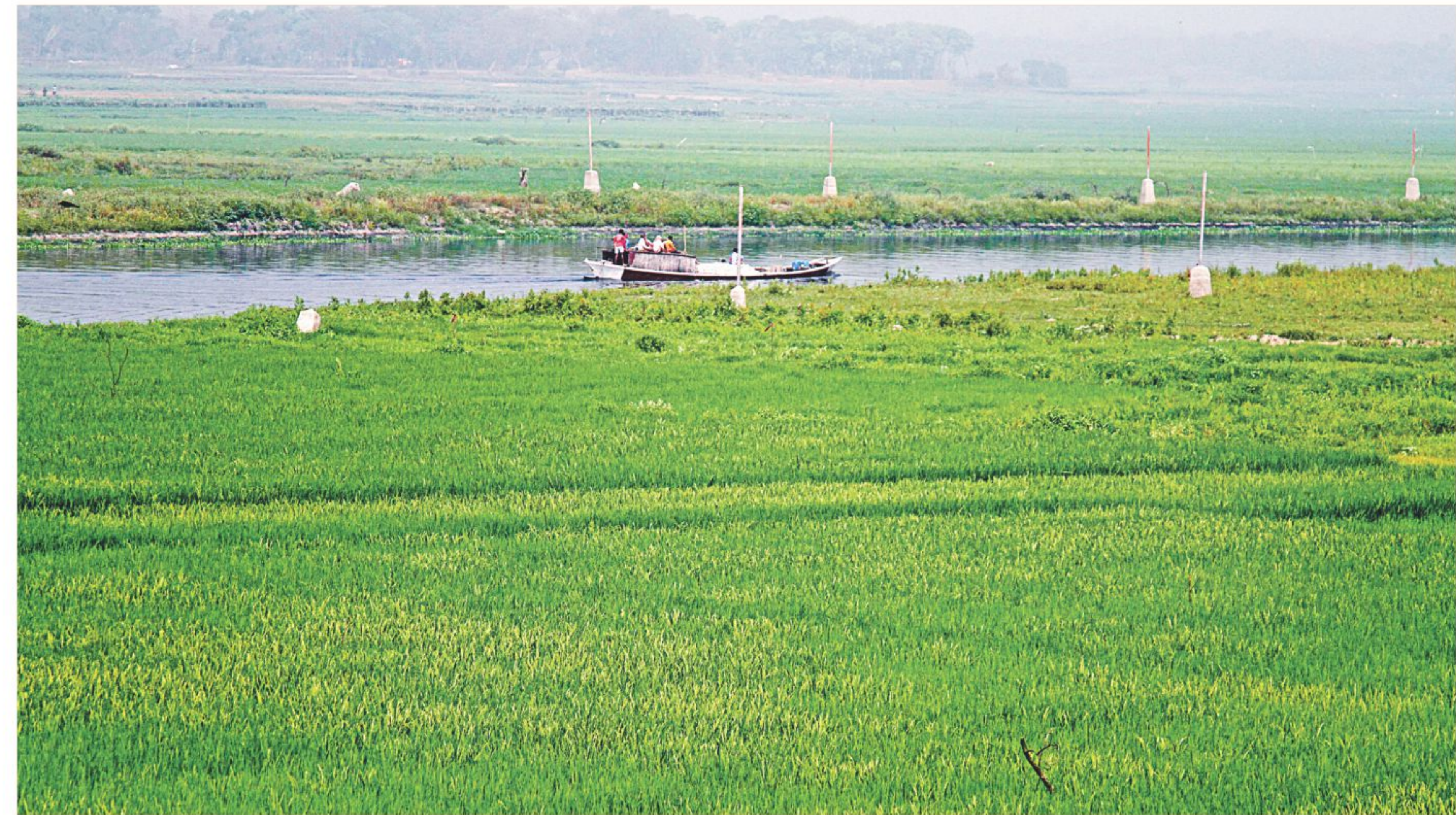
The rich greenery of a paddy field with flowering IRRI plants along the Turag river in Ashulia outside the capital Wednesday. Farmers are expecting a high yield this year. Harvesting is due in the upcoming Bangla month of Boishakh that begins on April 14.

The Alliance for Bangladesh Worker Safety, a platform of 27 US-based apparel retailers and brands, yesterday appointed 12 Bangladeshi and international leaders to its board of advisers. Five of the advisers are from Bangladesh, according to a statement of the Alliance, which was formed with the intent of improving safety in Bangladeshi ready-made garment (RMG) factories. "We are honored to welcome these esteemed global leaders to our Board of Advisors," said Ellen Tauscher, independent chair of the Alliance and former US Congresswoman. "The combination of their individual perspectives and breadth of expertise across government, women's issues, labor and global development will help us implement our comprehensive commitment to a safer ready-made garment industry in Bangladesh," she adds.