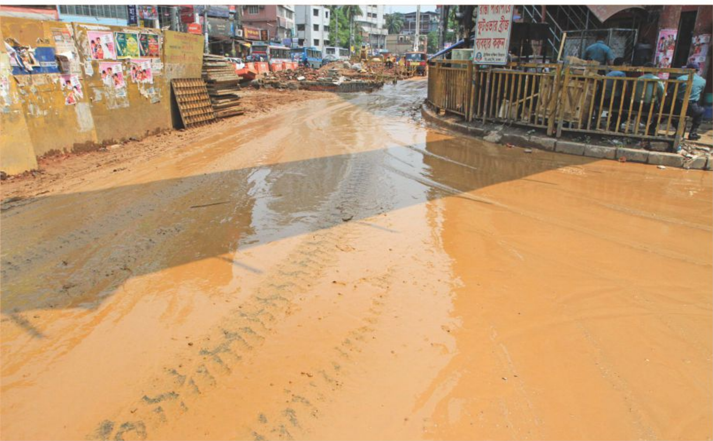
With construction work going on for a flyover in Moghbazar of the capital, the sudden downpour on Thursday night has left the area under the footbridge in Moghbazar muddy and difficult for vehicles and pedestrians to move on. The photo was taken yesterday.