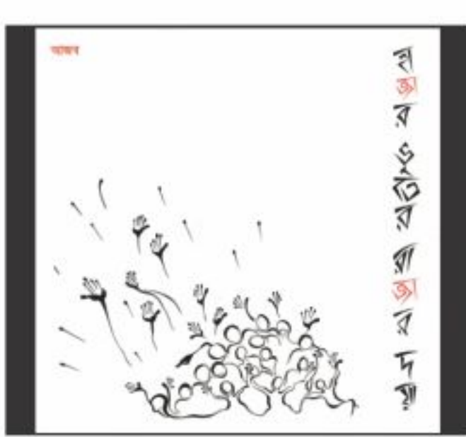
Hajar Bhooter Rajar Doya Band: Ajob