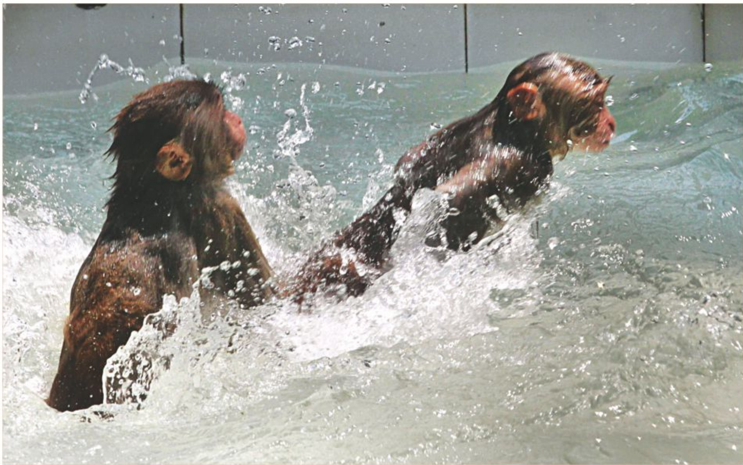
Two monkeys play in the pool at Dhaka Zoo yesterday as spring draws to an end and the summer heat increases.