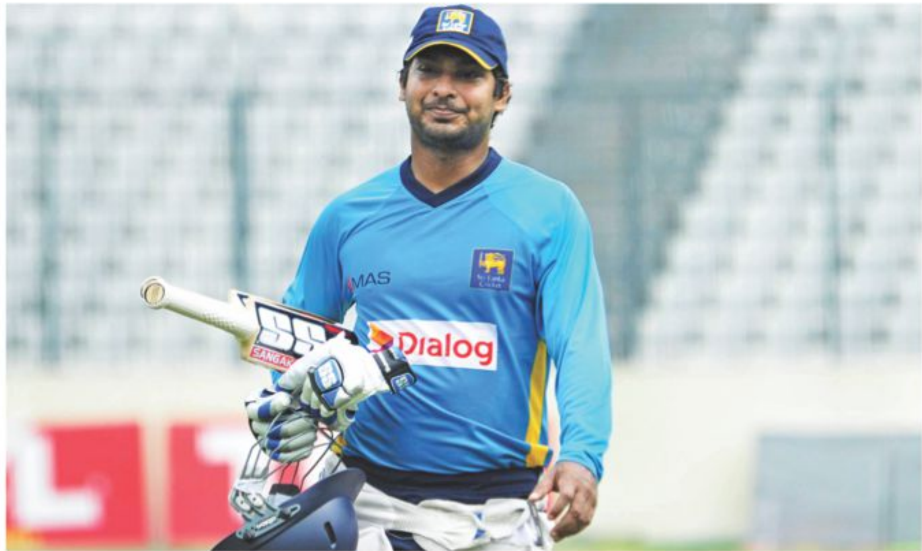
Champion Sri Lanka batsman Kumar Sangakkara has been scoring heavily in his latest Bangladesh sojourn. The left-hander will be at the centre of Lankan batting when his side meet India in a crucial Asia Cup match at Fatullah today.