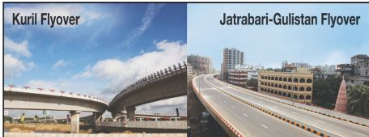
Major portions of these two Mega Projects are built with Crown Cement, the Gold Trophy winner in export. Because of consistent quality, Crown Cement is being regularly used in mega projects like Mogbazar-Mouchak Flyover, Comilla Flyover and extension of Khilgaon Flyover. — Crown Cement.

While a quick turnaround from the Sri Lanka series will no doubt be difficult, it seems as though the hosts have taken the first step and improved their batting. With the Afghanistan game coming up next the hosts will be keen to complete the turnaround process with a win that has eluded them ever since the start of this year.