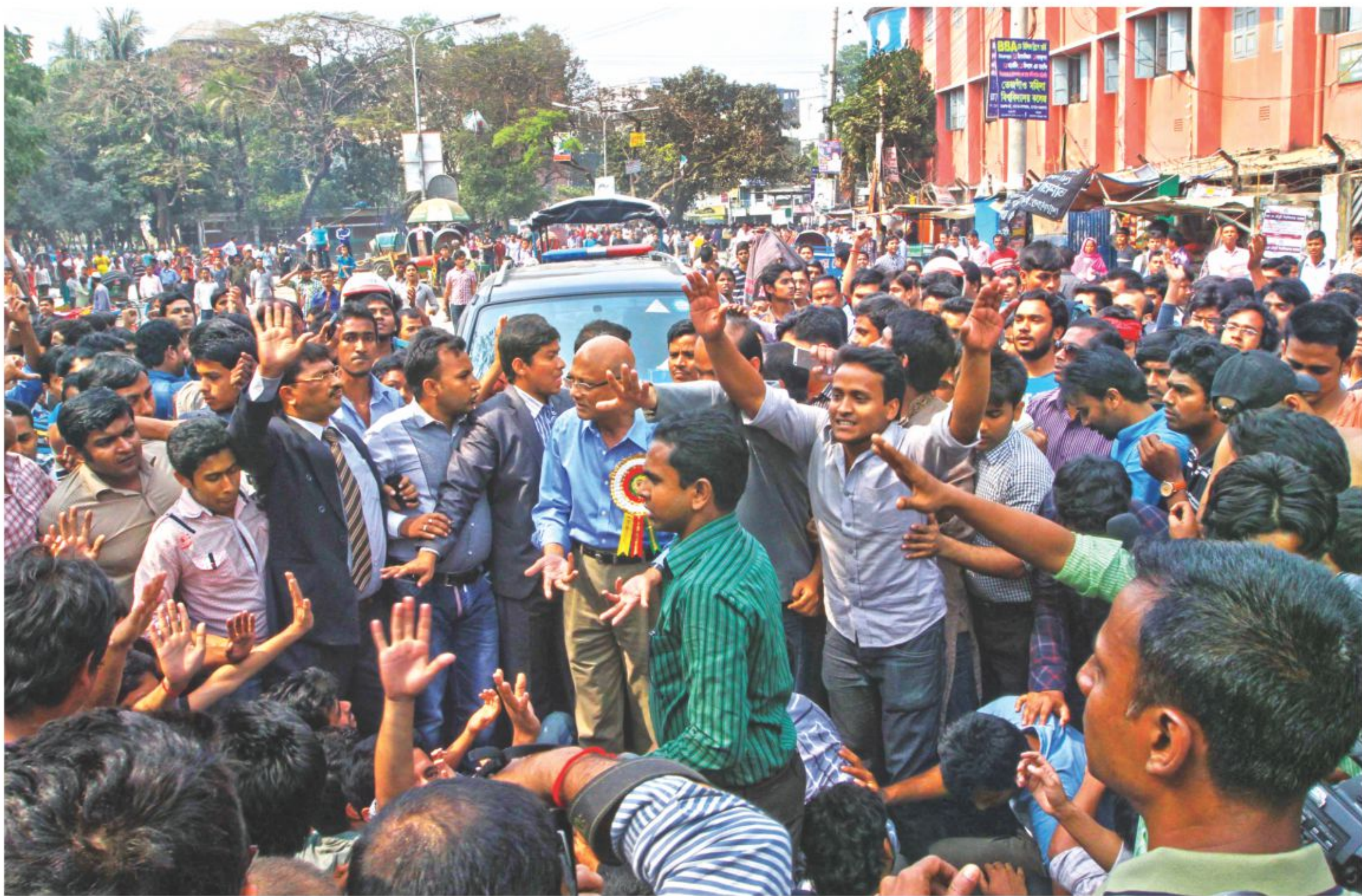
Education Minister Nurul Islam Nahid tries to calm down the agitating students of Jagannath University after they stop the minister's motorcade near the university demanding the buildings they used to use as dorms be returned to them.