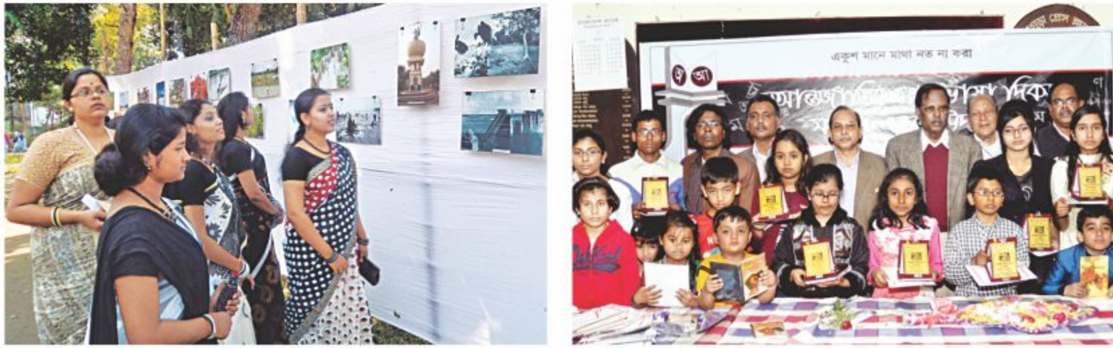
Clockwise (from top): Children take part in writing competition; awardees with guests at the programme and visitors at the exhibition.