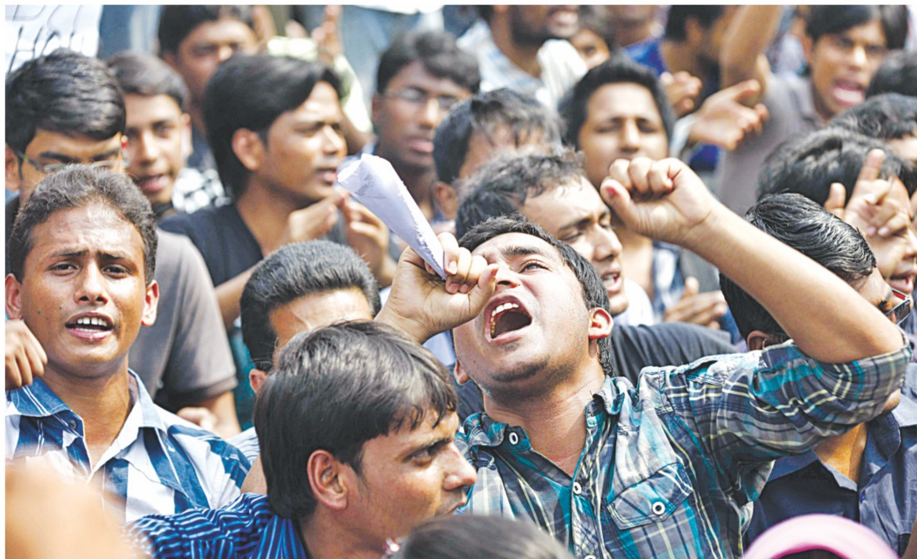
Jagannath University students demonstrate in front of the Jatiya Press Club yesterday to protest Sunday's police action, and demand retrieving 11 dormitories from grabbers.