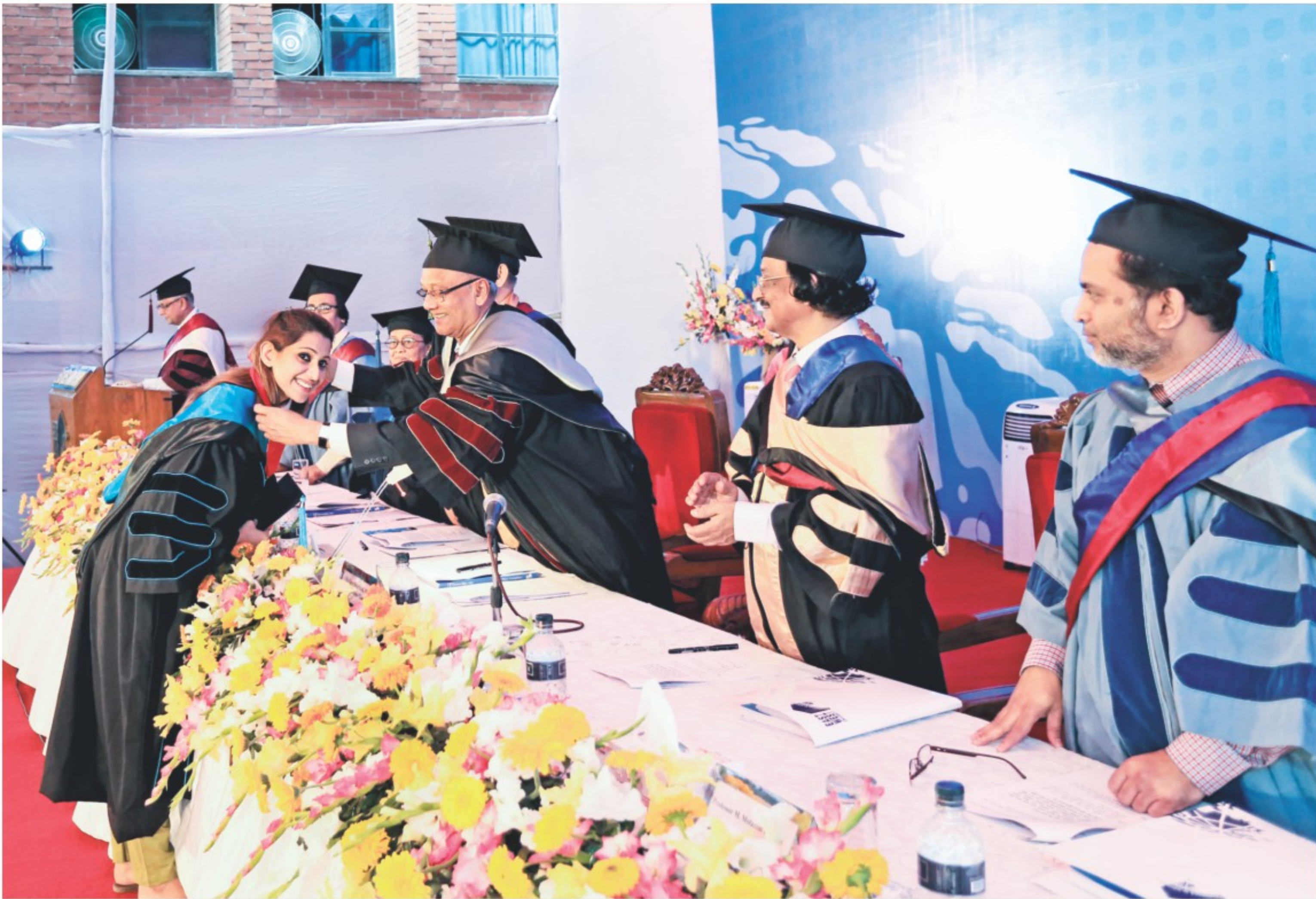
Education Minister Nurul Islam Nahid presents a graduate of East West University with a gold medal during the university's 13th convocation on its campus in the capital's Aftabnagar yesterday. A total of 1,341 students were conferred degrees this year.