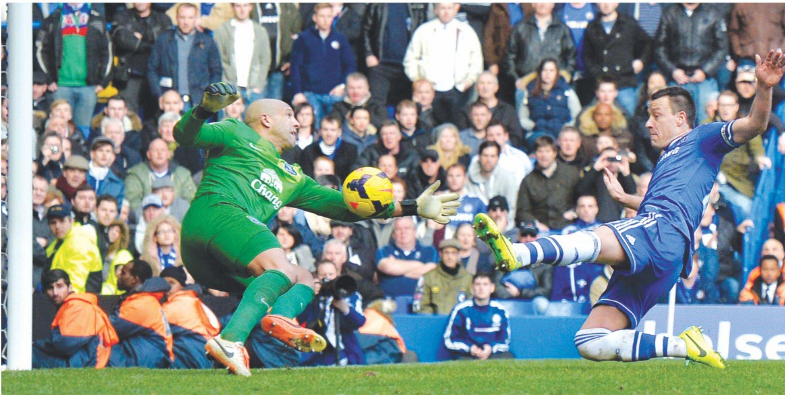
Chelsea captain John Terry (R) scores the all-important during their Premier League encounter against Everton at Stamford Bridge yesterday.

Fulham were on course to climb off the foot of the table thanks to Ashkan Dejagah's 28th-minute goal, only for Matej Vydra to plunder an 86th-minute equaliser with a shot that squirmed past Maarten Stekelenburg.