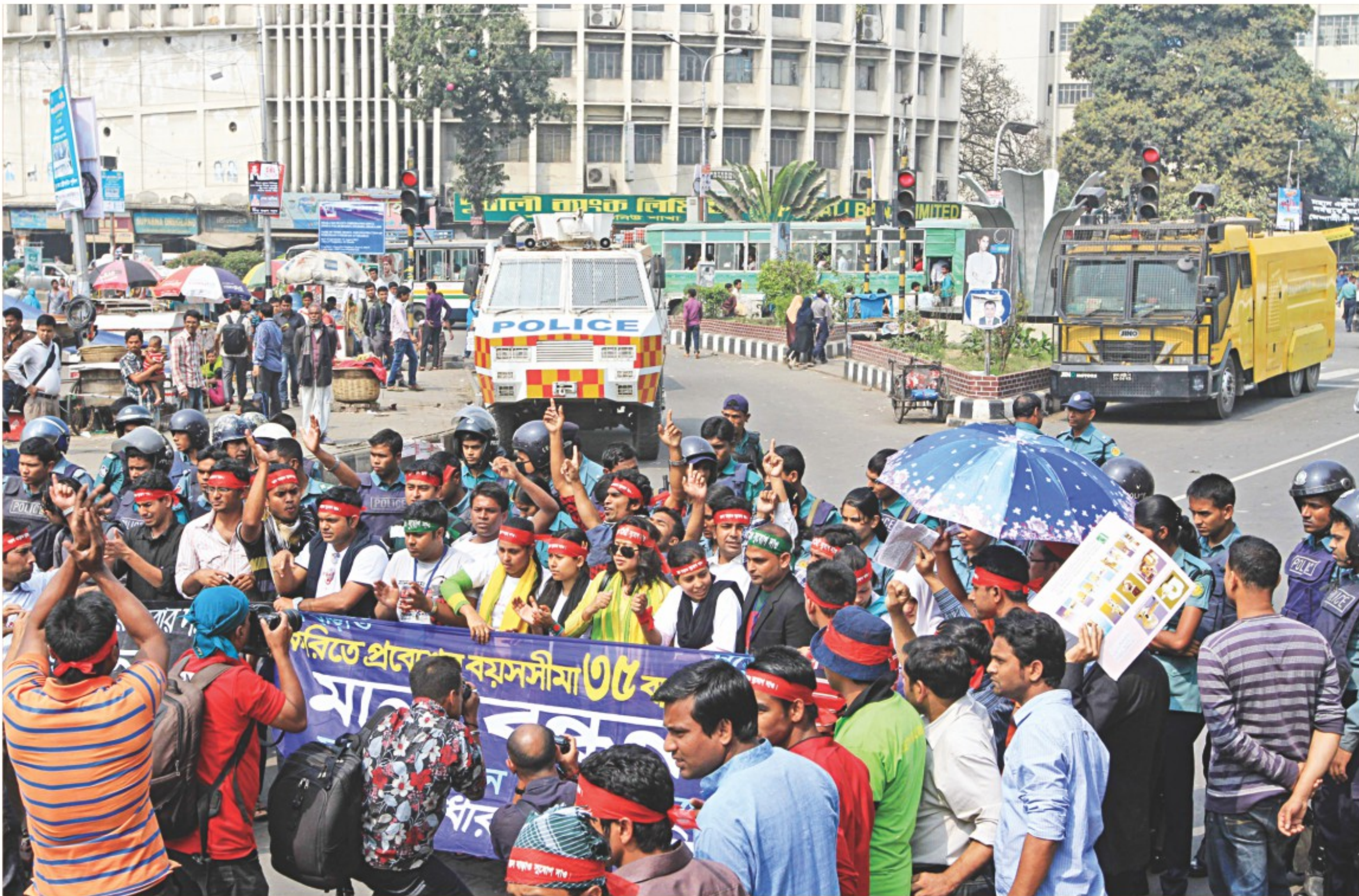
Bangladesh Shadharon Chhatra Parishad blocks off the road before Bangladesh National Museum in the capital yesterday demanding that the age limit for applying for public jobs be increased to 35.