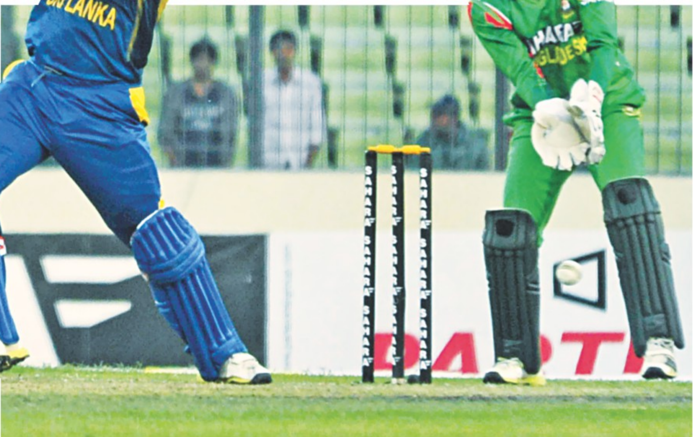
Sri Lanka all-rounder Thisara Perera pulls one on way to scoring an unbeaten knock of 80 runs, which not only revived their teetering innings, but also played a big role in coming out with a 13-run win over Bangladesh in the first one-dayer at the Sher-e-Bangla National Stadium in Mirpur yesterday.

But McCullum said there were other considerations given India's high-profile batting line up.